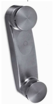
Easy Glass® glass adapter 0760, from easy glazing systems.

This is to be used on the 1.8m high glazing due to additional support and strength required.