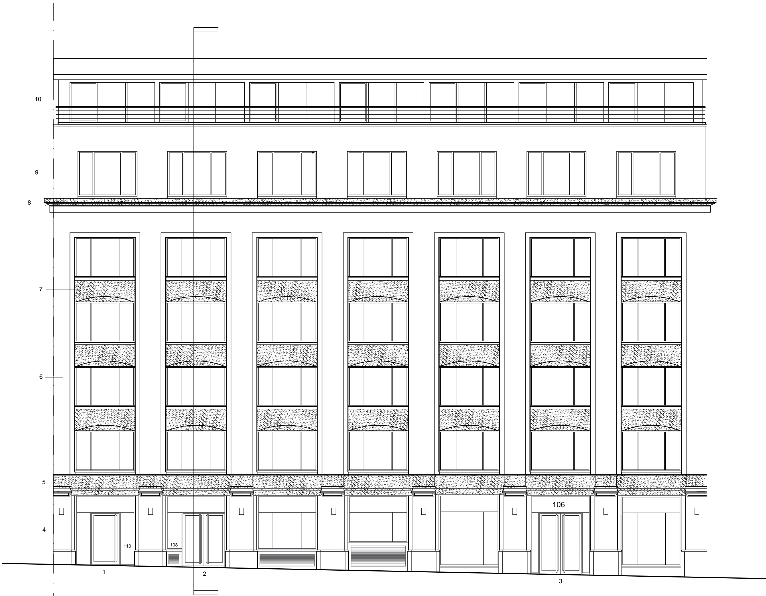
KENTISH TOWN ROAD ELEVATION