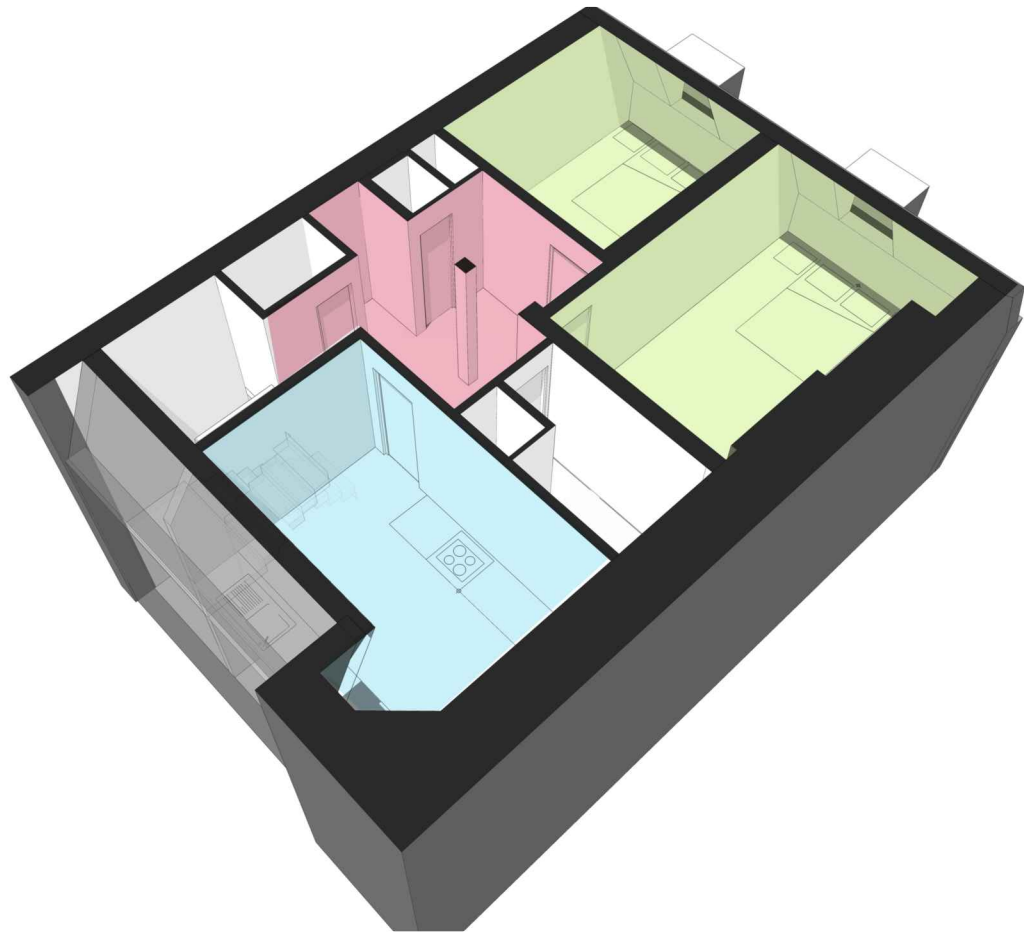
1 3D Image of Existing Layout