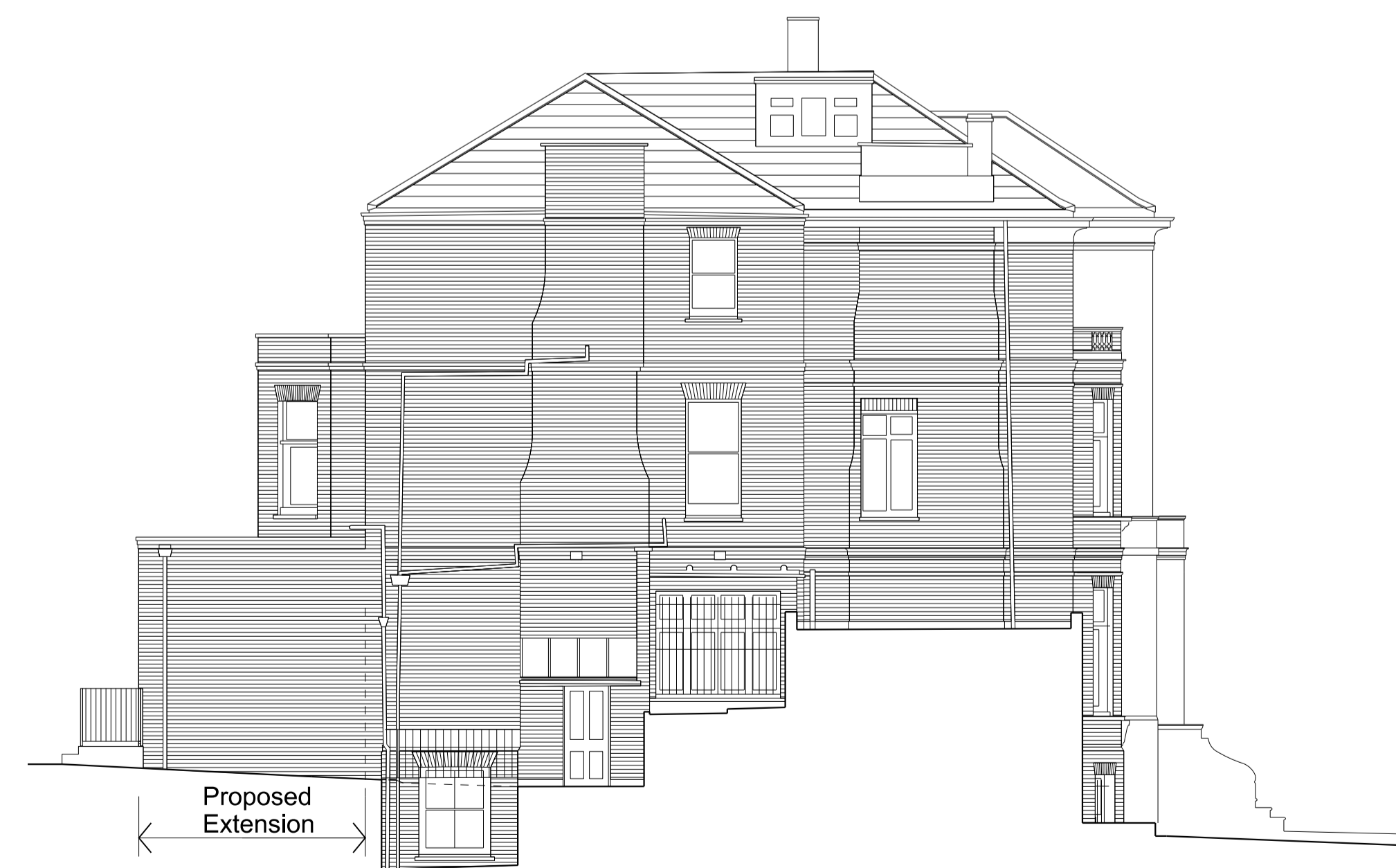
Proposed Side Elevation (South)