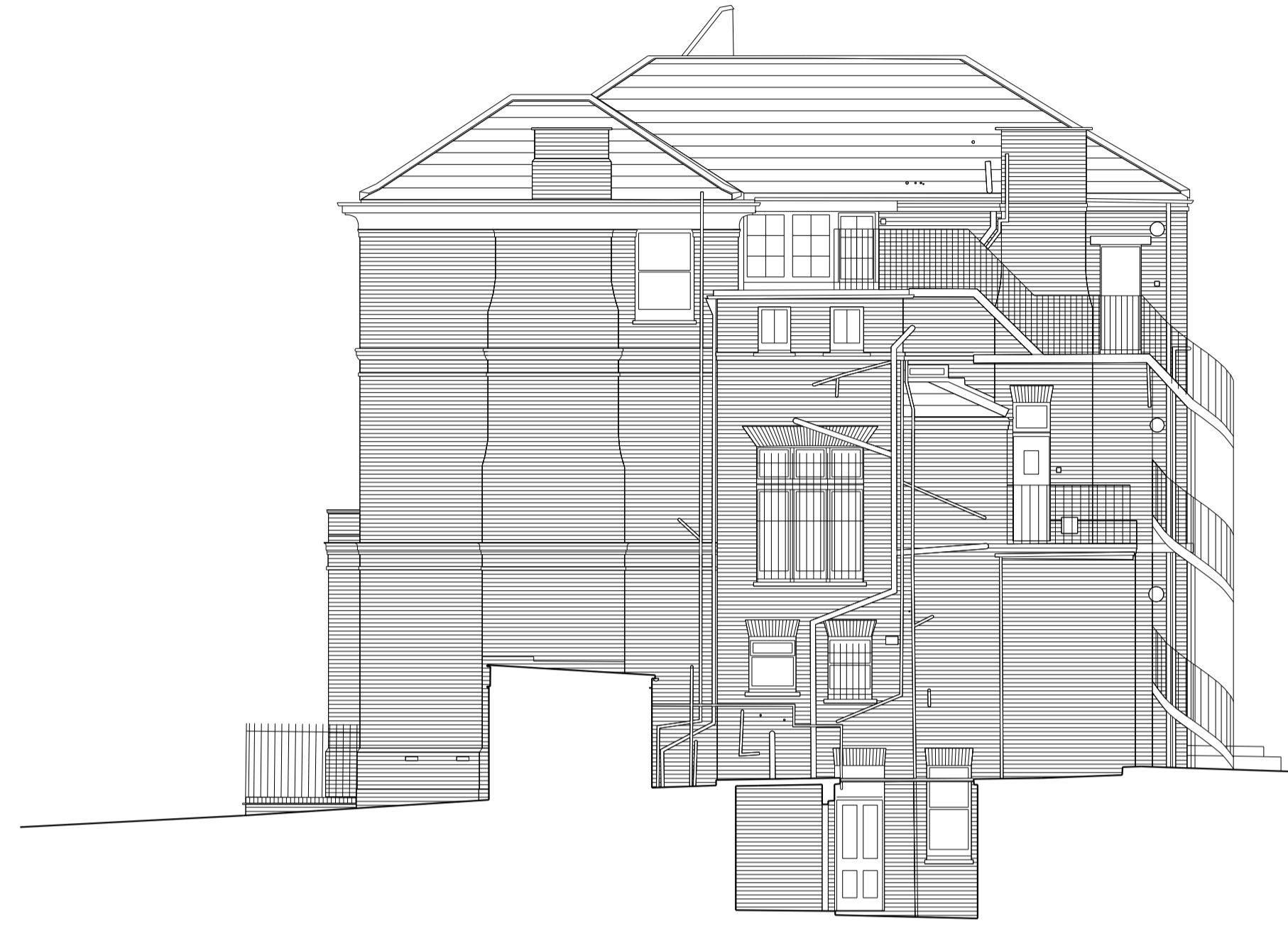
Existing Side Elevation (North)