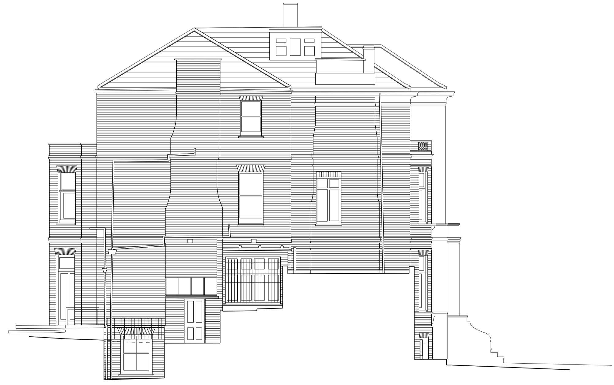
Existing Side Elevation (South)