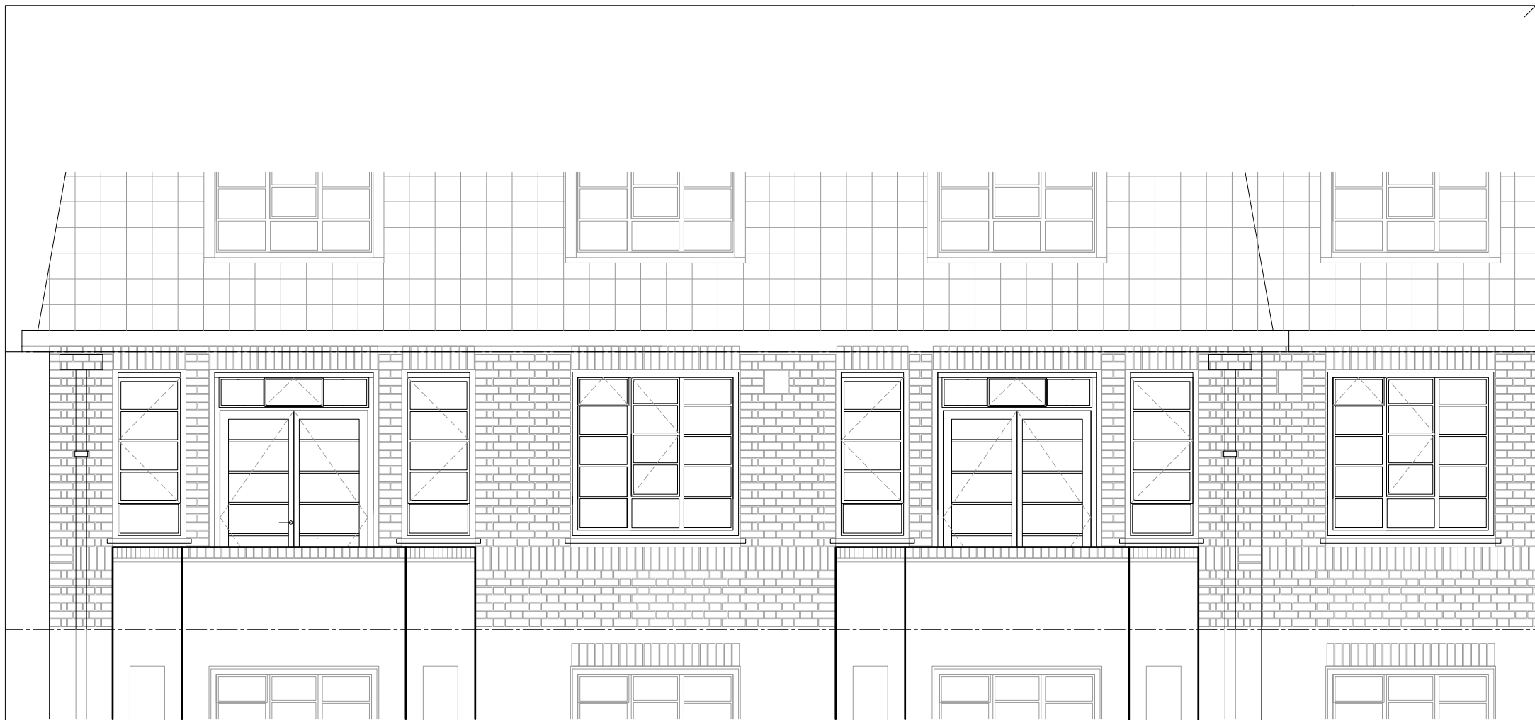
FRONT ELEVATION - A