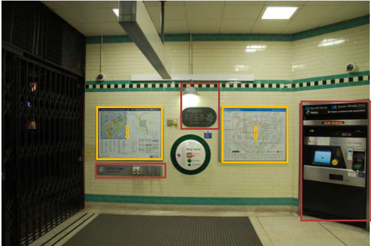
Information Point Wall