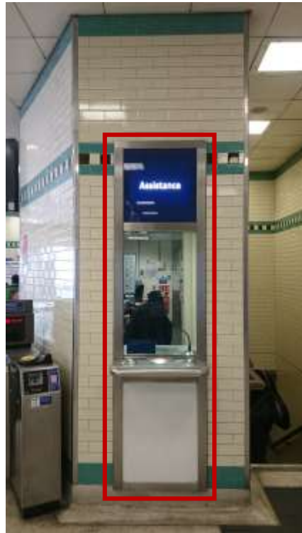
Existing Assistance window