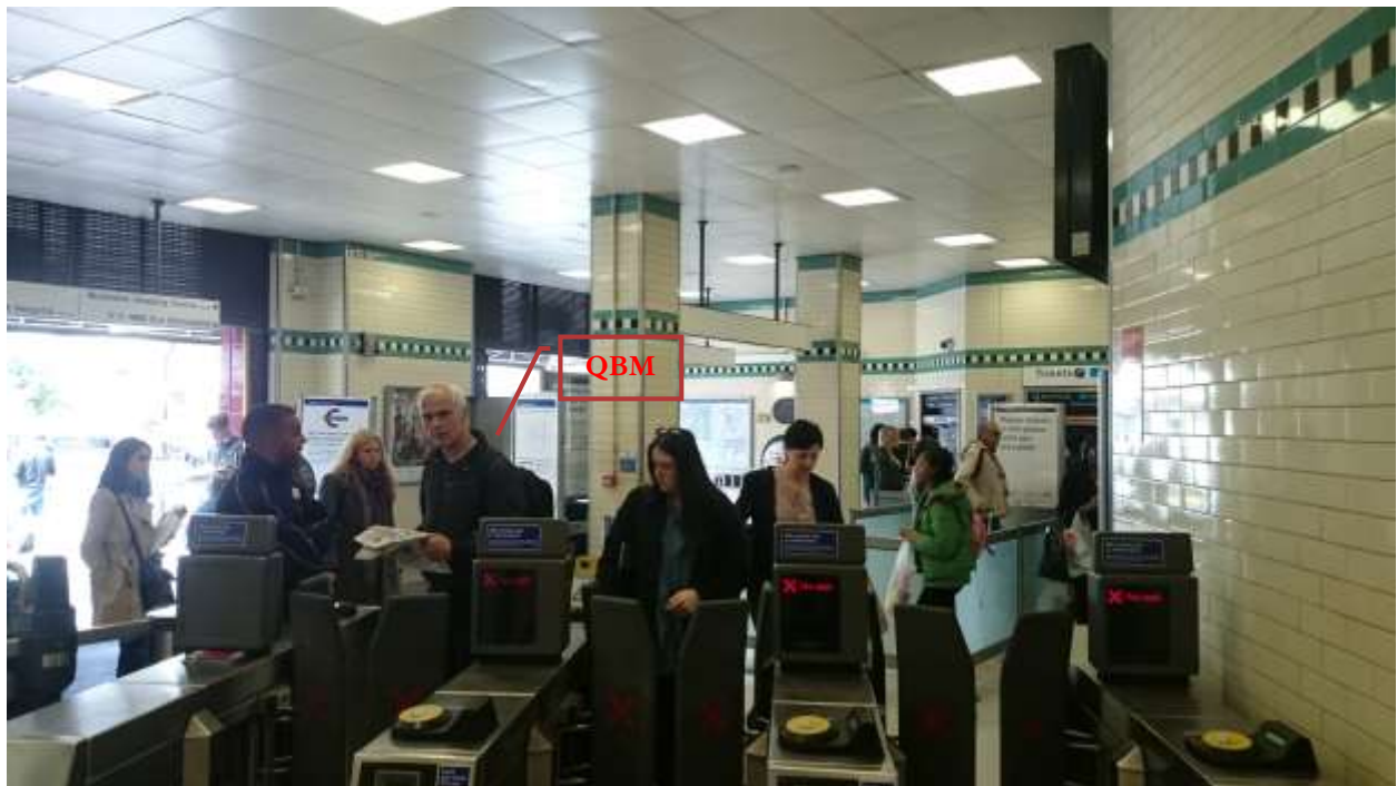
Ticket Hall – Gate line