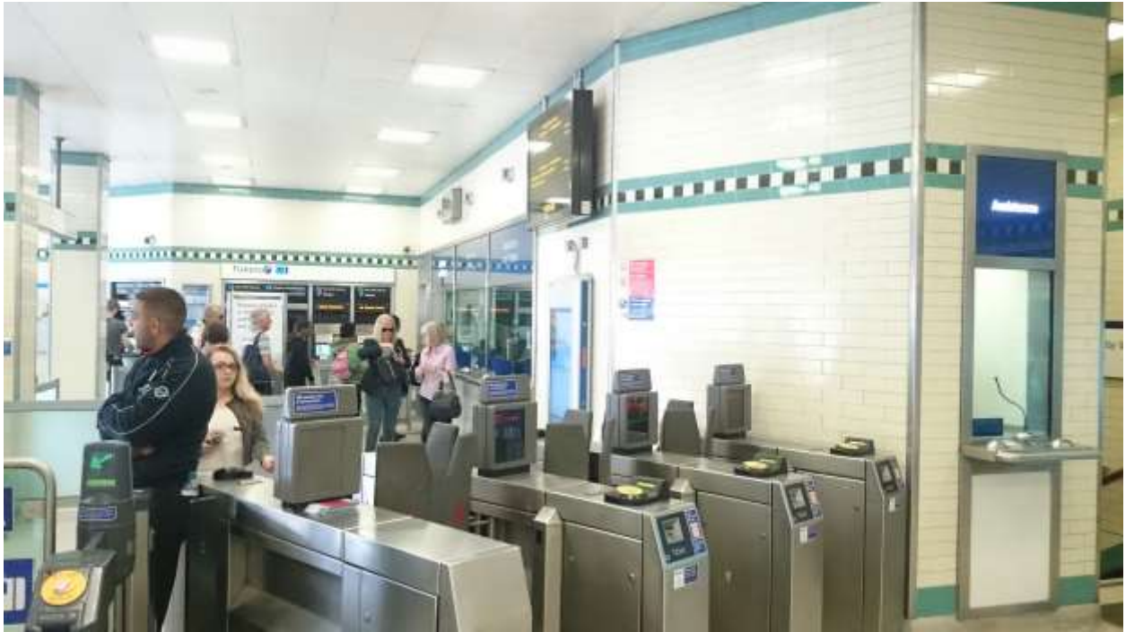
Ticket Hall – Gate line