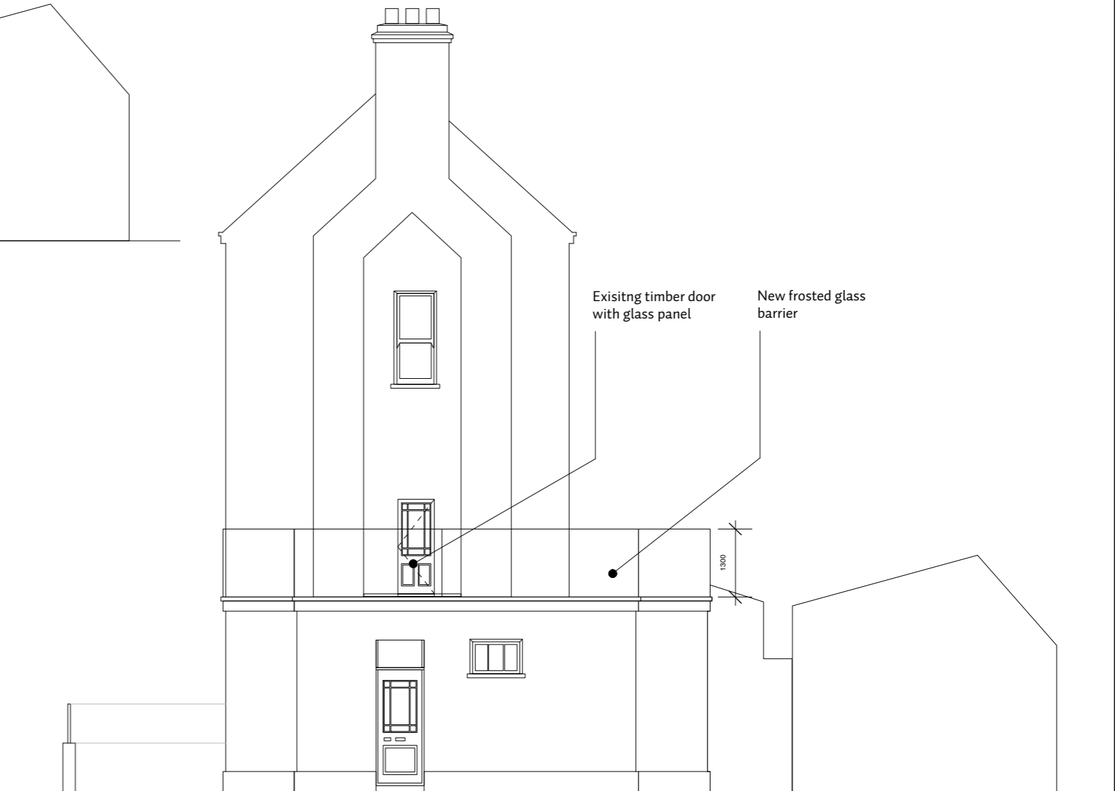
3 Proposed Side Elevation Scale @A3 1:100