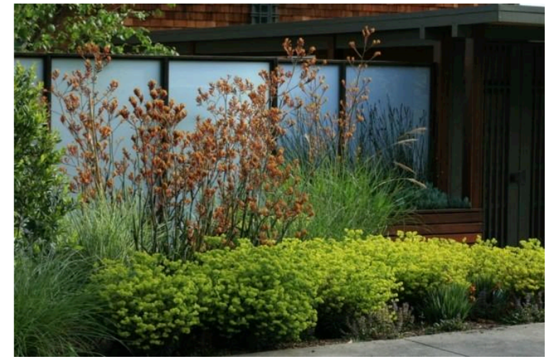
4 Proposed frosted glass barrier Scale @A3 1:50