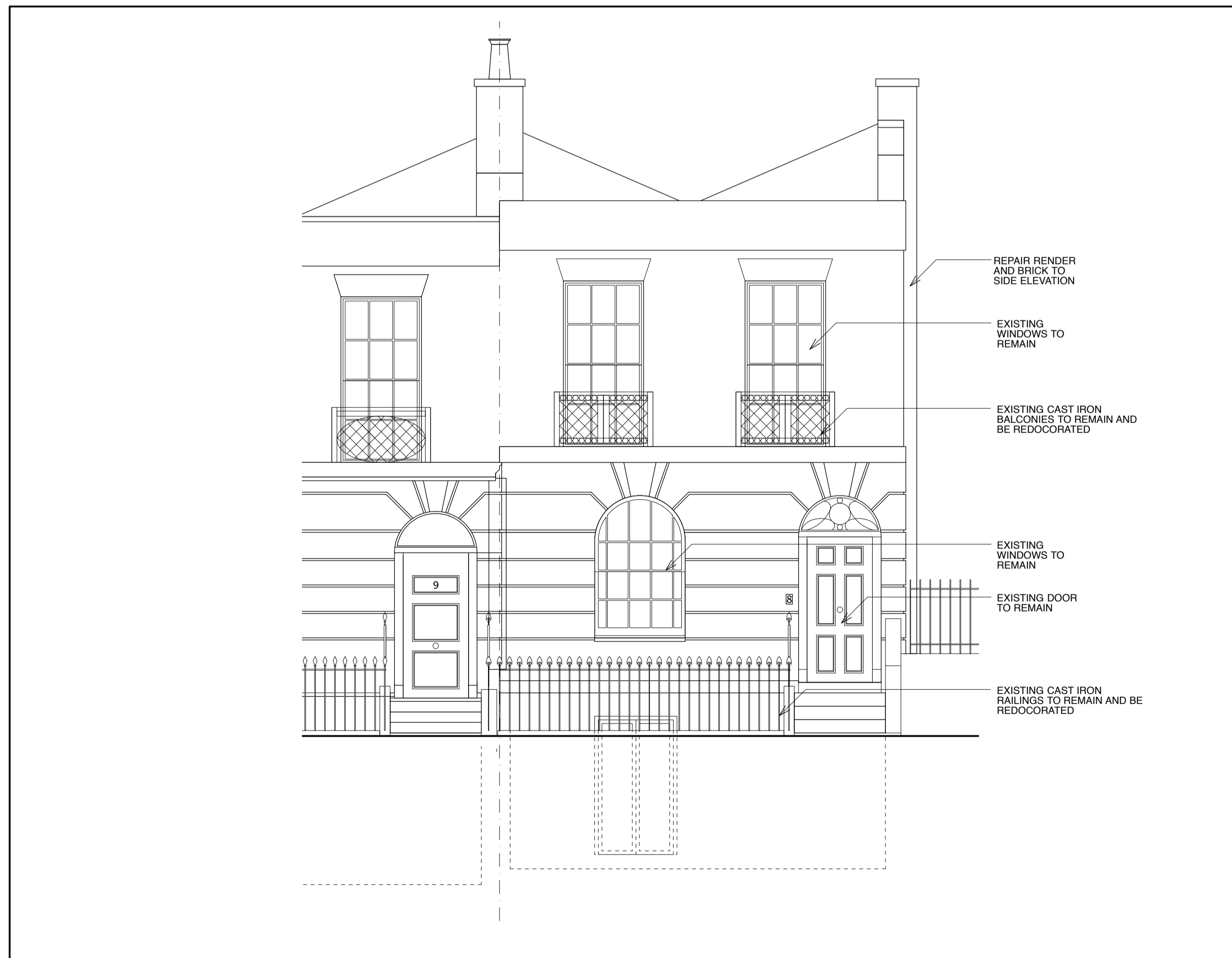
1 FRONT ELEVATION - 1:50@A1