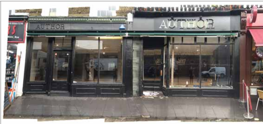
EXISTING STORE FRONT PANORAMA