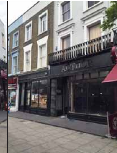
EXISTING STORE FRONT FROM RIGHT