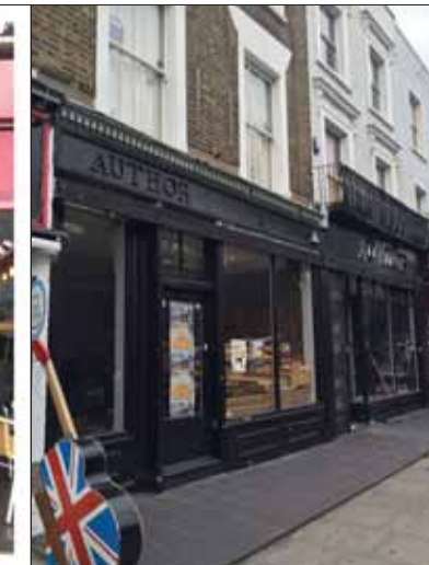
EXISTING STORE FRONT FROM LEFT