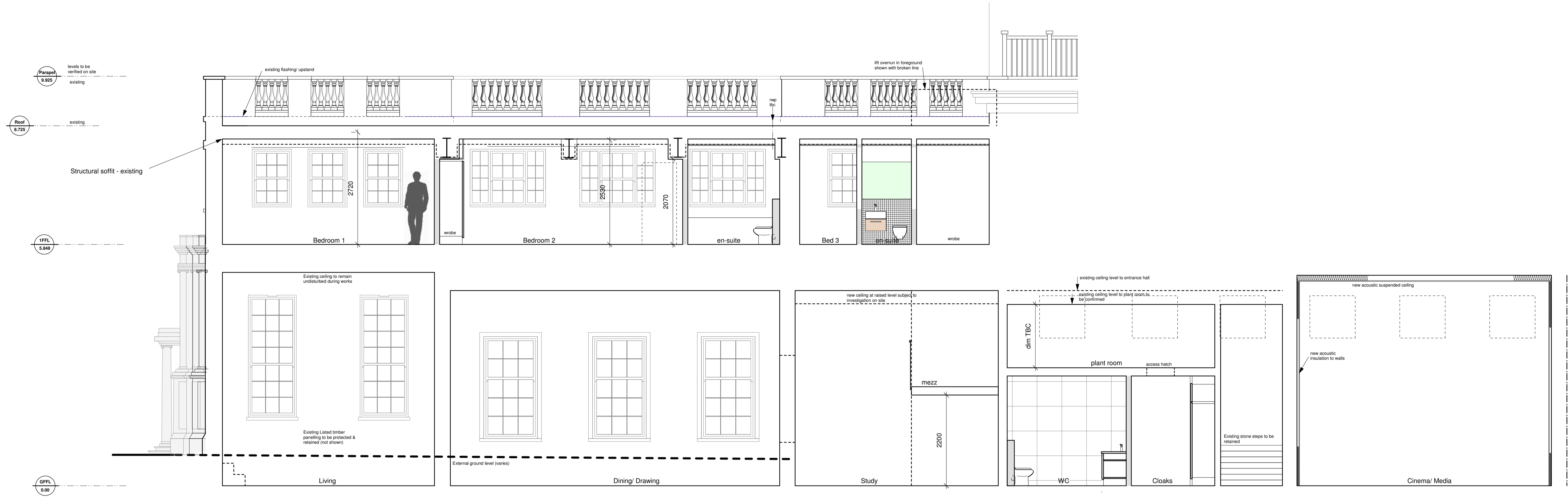
Proposed Section B-B (1:50)