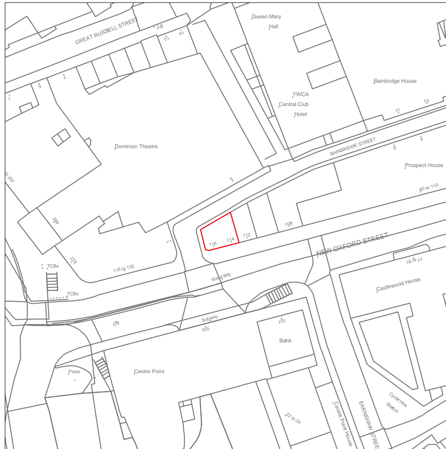
SITE LOCATION PLAN - SCALE: 1:1250 @ A3 SITE AS OUTLINED IN RED STARBUCKS COFFEE SHOP, 112-116 New Oxford Street. London, WC1A 1HH

ORDNANCE SURVEY MAP LICENSE NUMBER: 100041040 PLOT NUMBER: 00406809