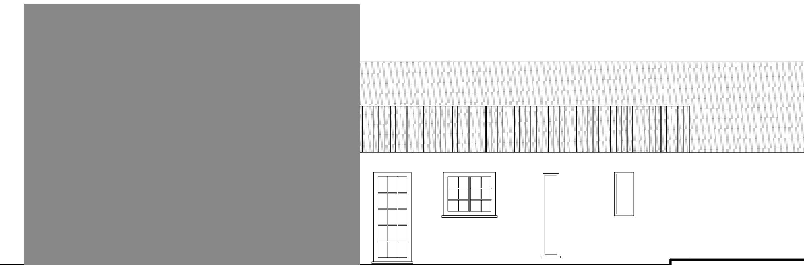
West Flank Elevation