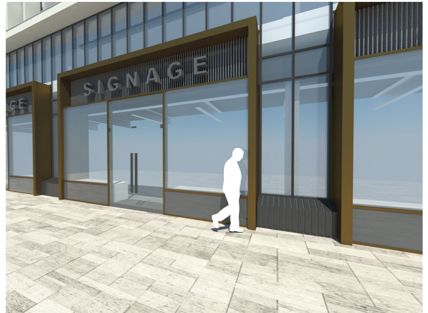
Seat perspective view