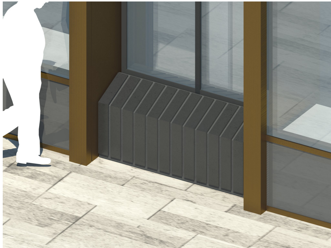
Seat isometric view