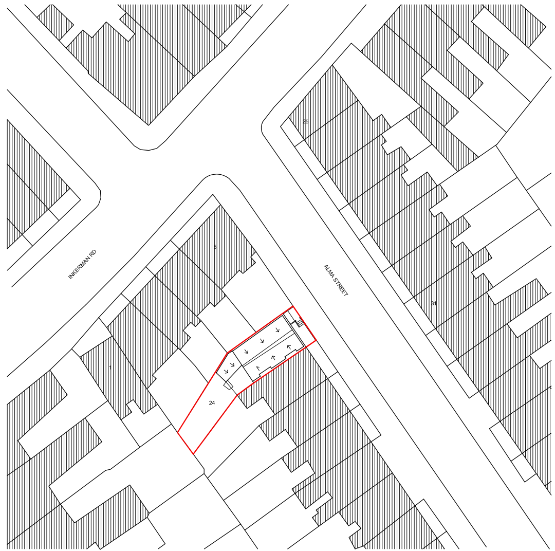
Existing Site Plan 1:500