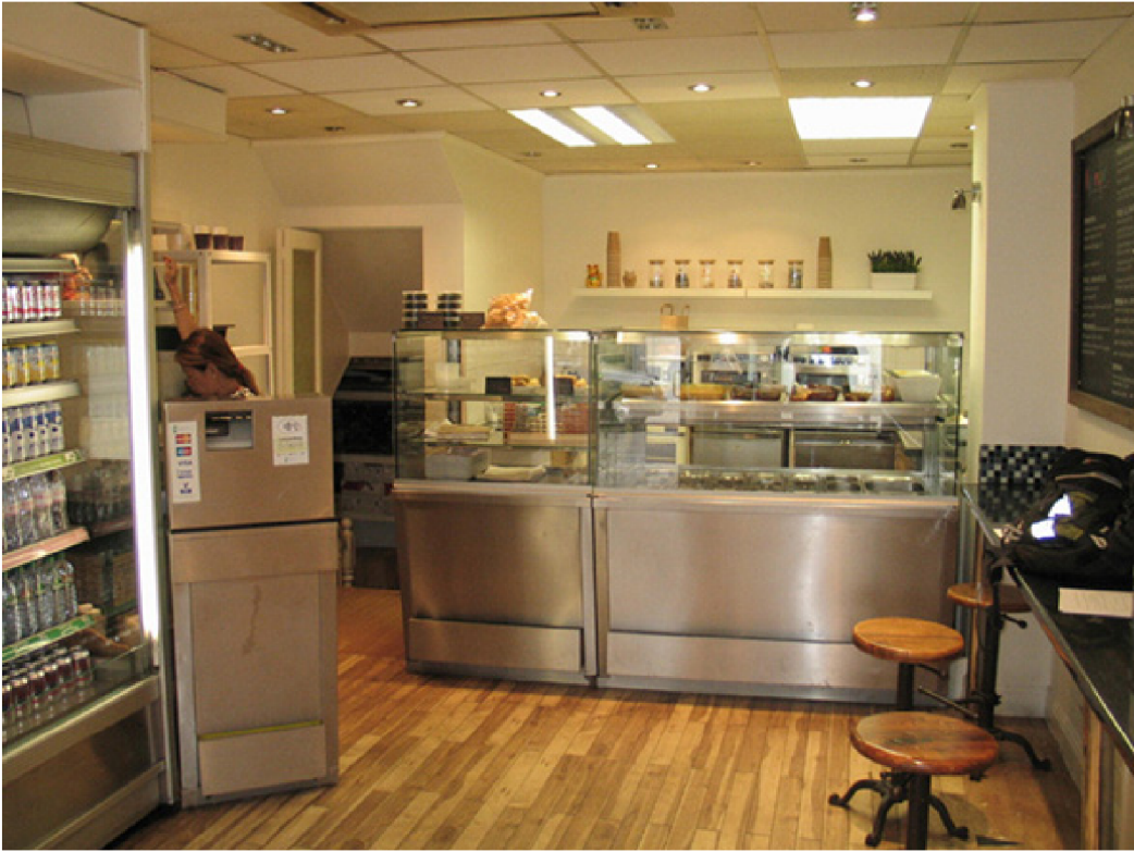
PIC.03 Interior view of Nyonya cafe