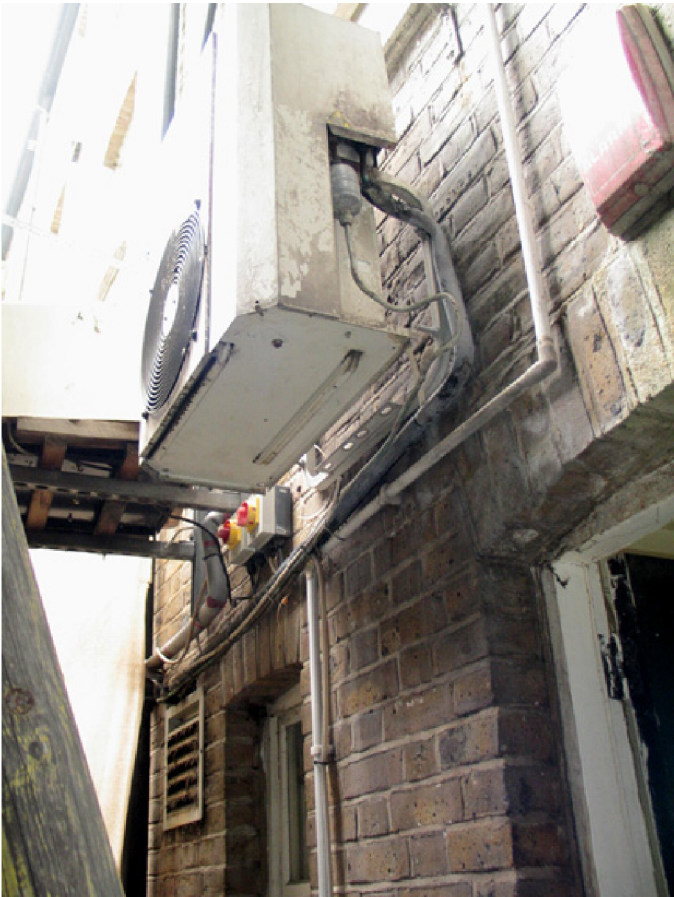
PIC.03 Emergency exit, extractor louvres and AC units