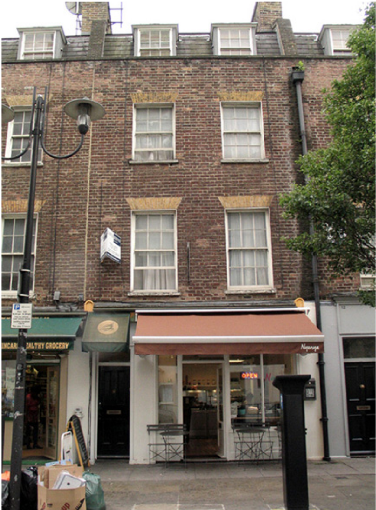
PIC.01 Front view of entire building