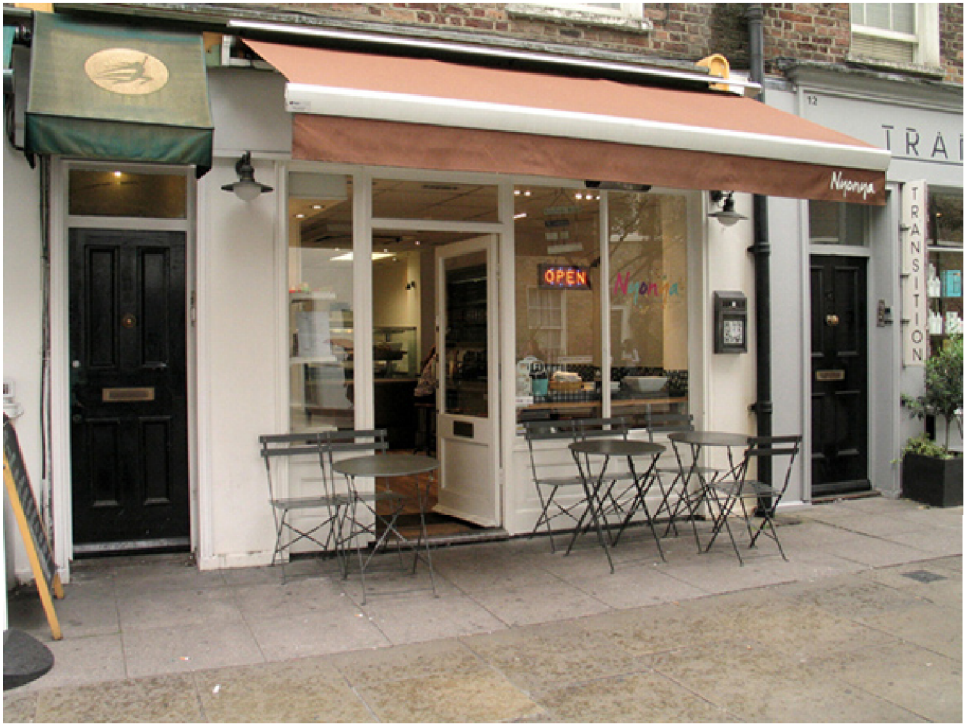
PIC.02 View of Nyonya cafe shopfront and the entrance to the flat above