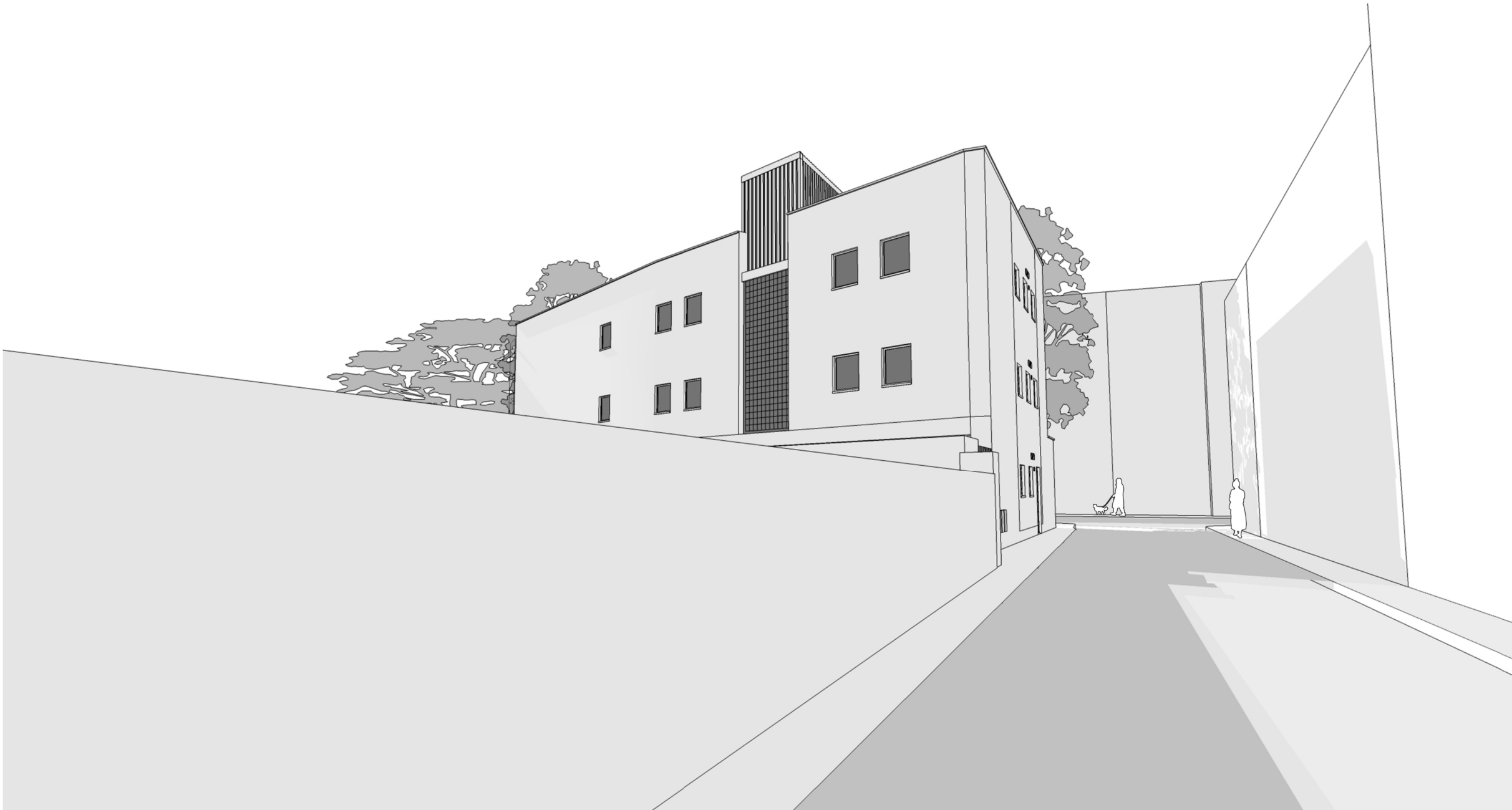
3. Existing Street View (3)