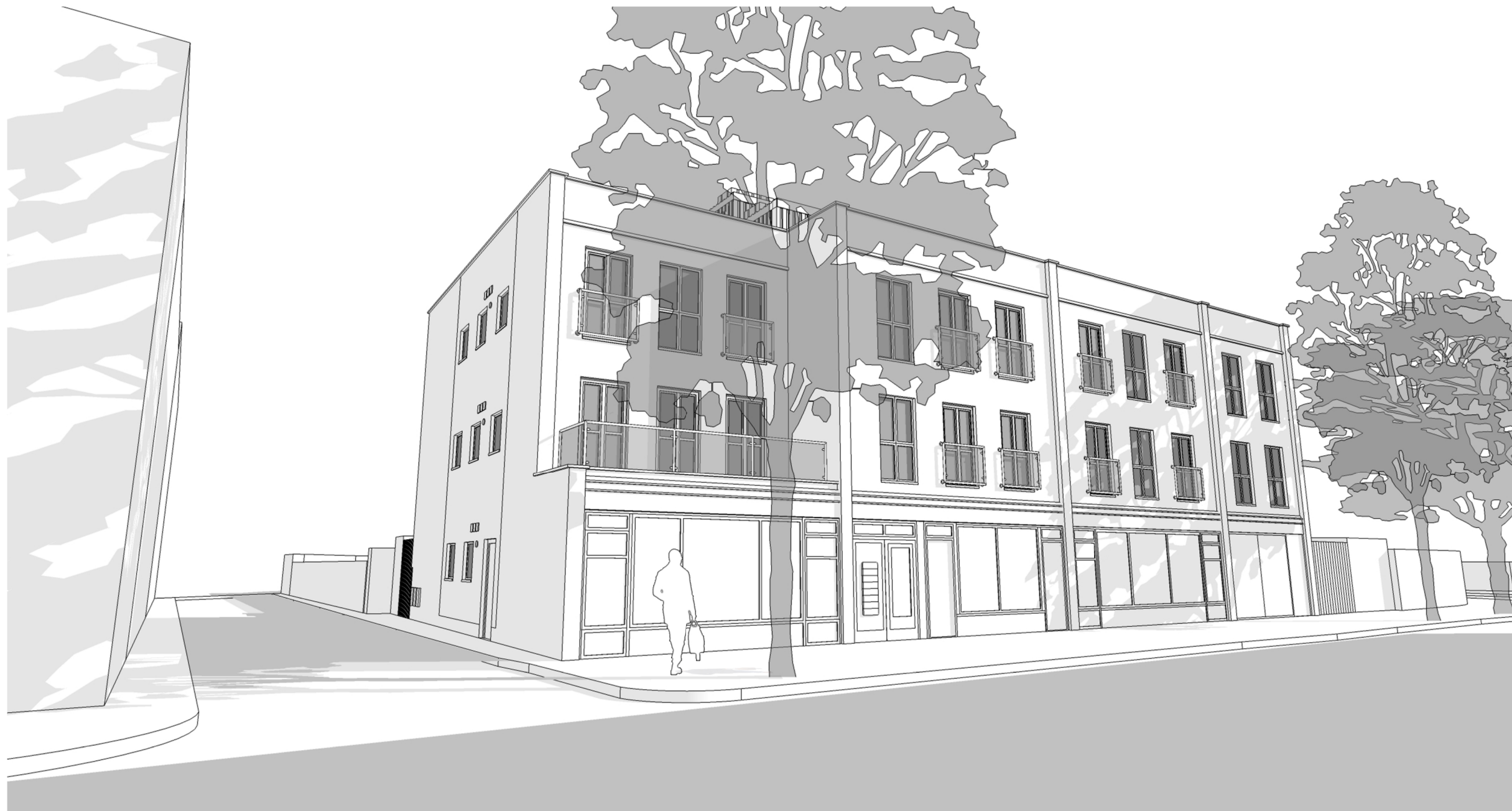
1. Existing Street View (1)