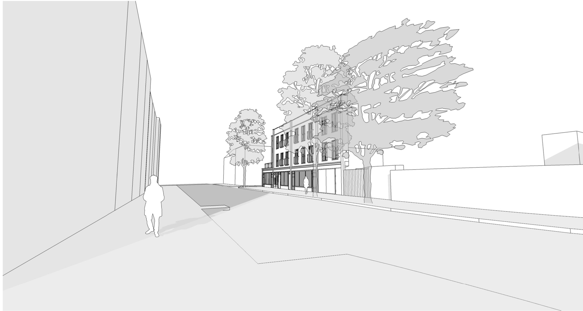
2. Existing Street View (2)