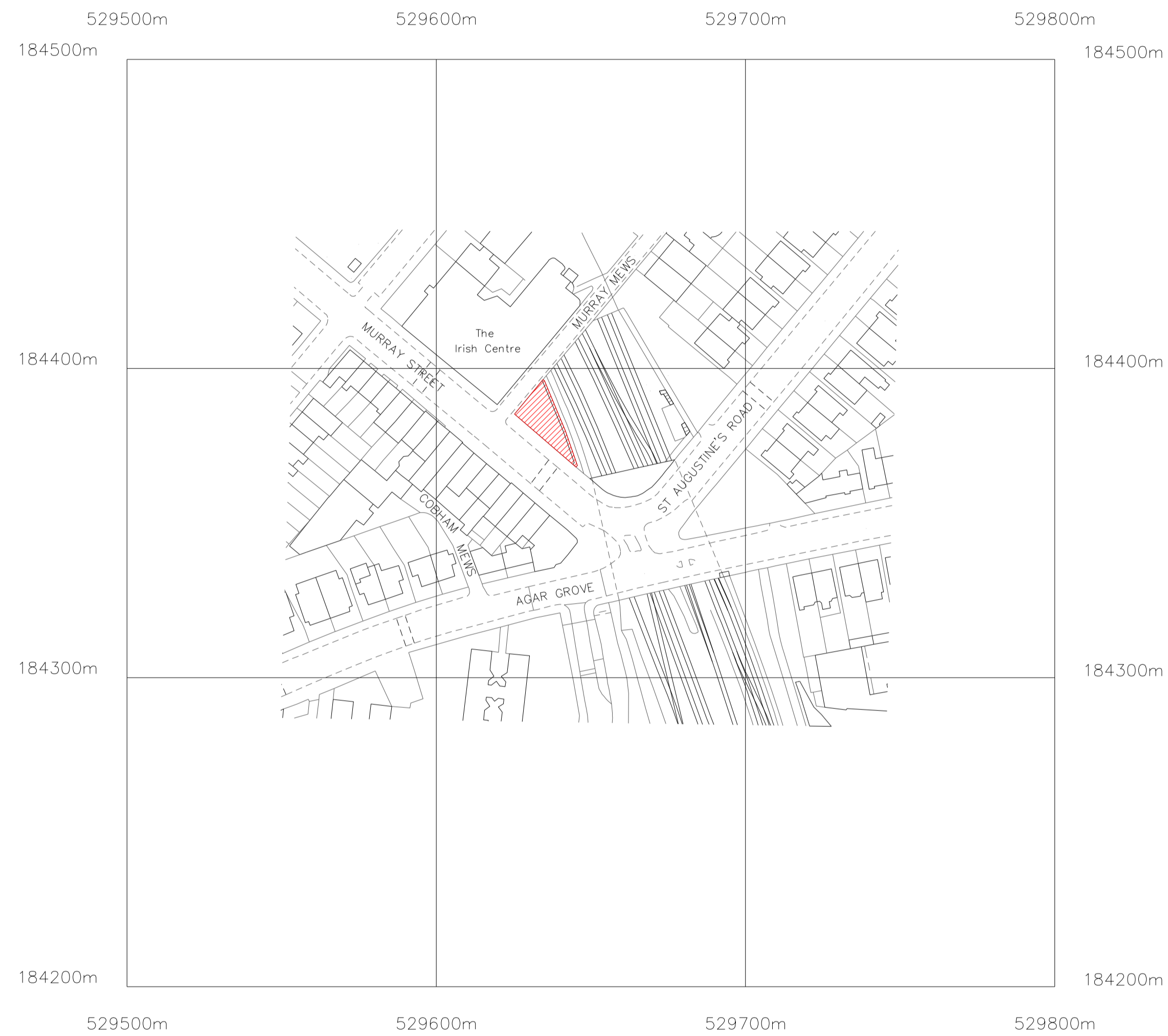
Location Plan 1:1250 @ A1