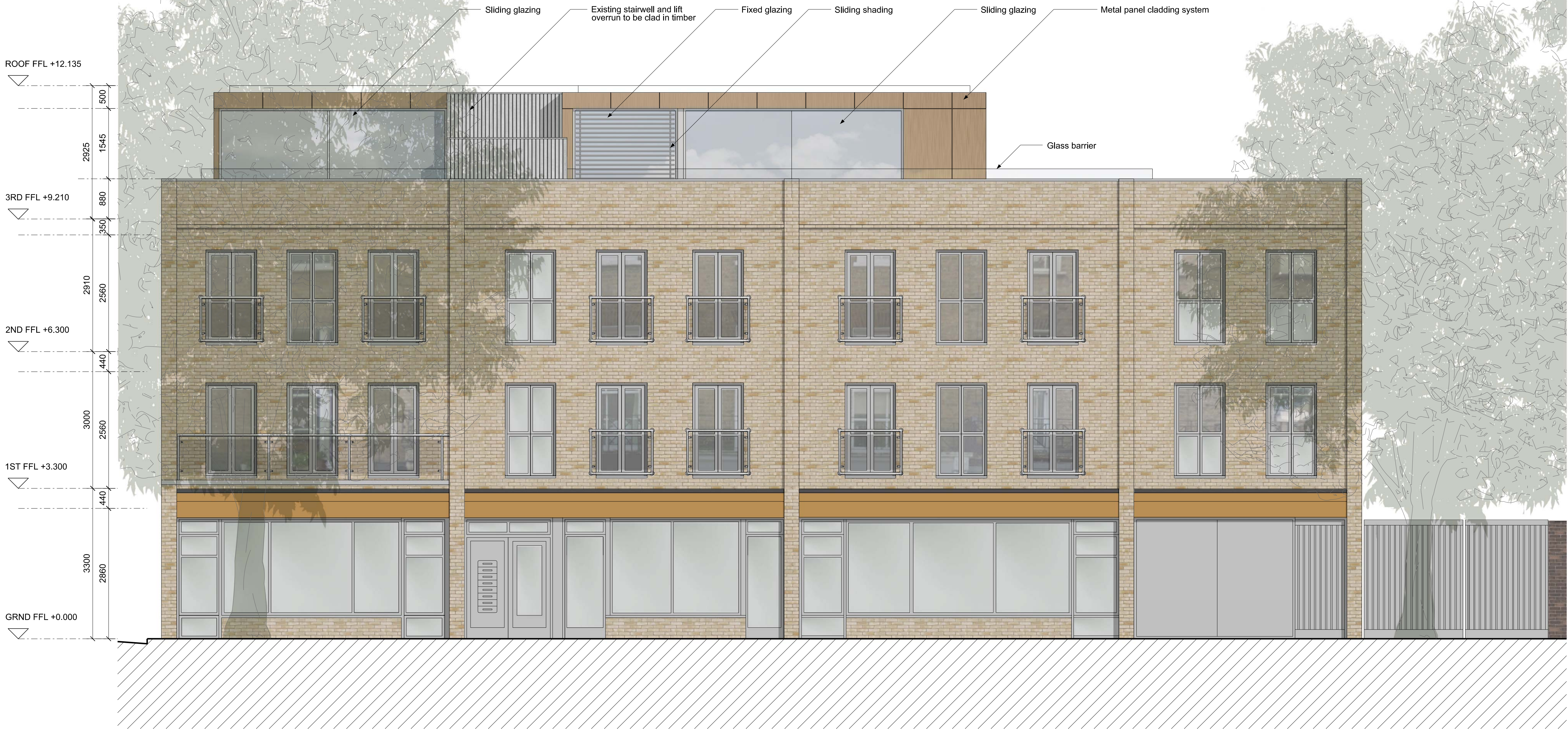
Proposed South West Elevation (Front)