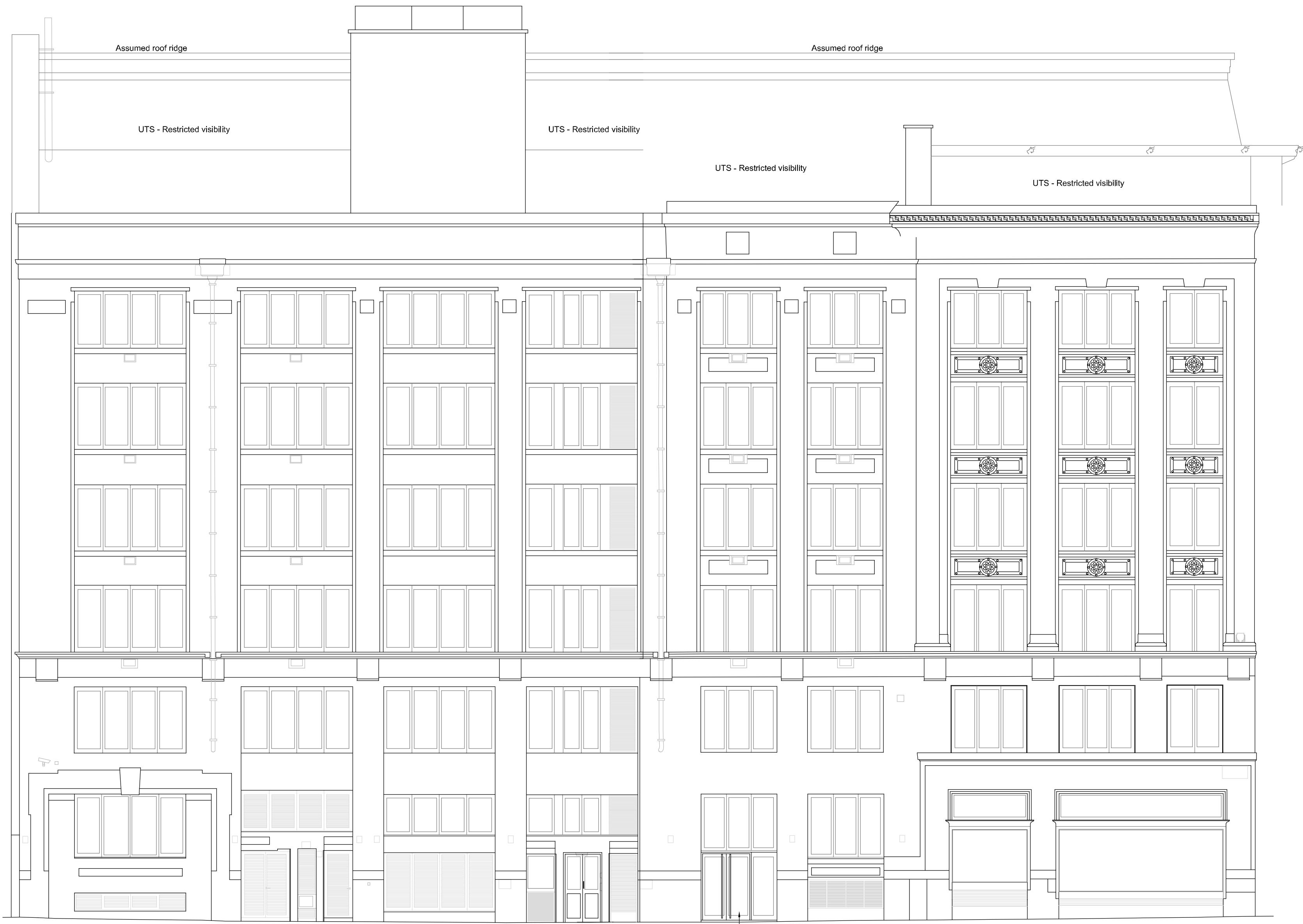
ELEVATION 5 (Remain) (Keeley St.)