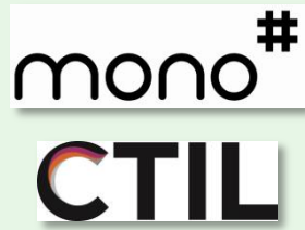
Image Prepared For: London South In association with: Mono Consultants Ltd 0161 839 8840