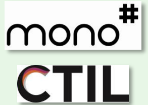
Image Prepared For: London South In association with: Mono Consultants Ltd 0161 839 8840