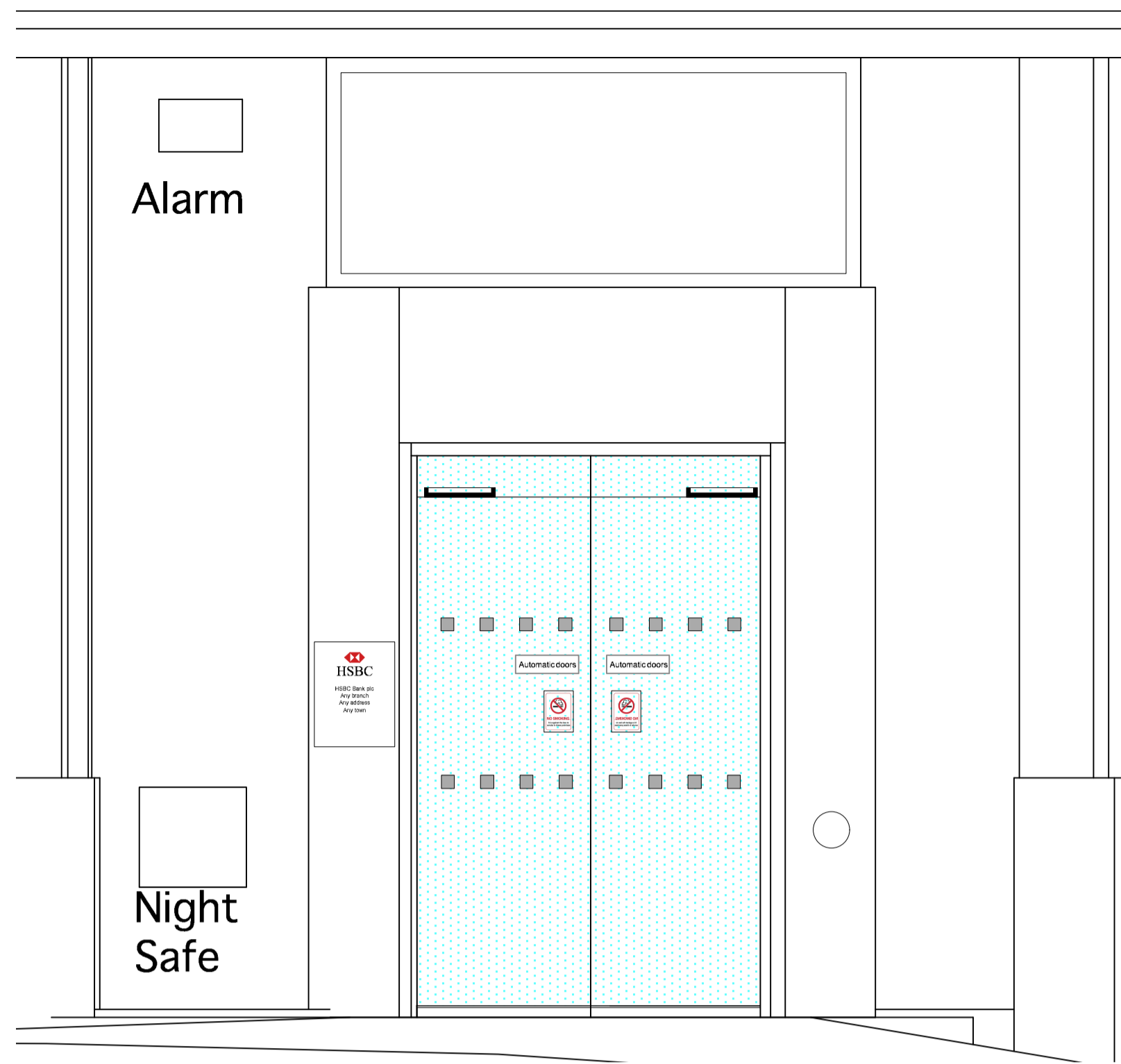
EXISTING MAIN ENTRANCE ELEVATION