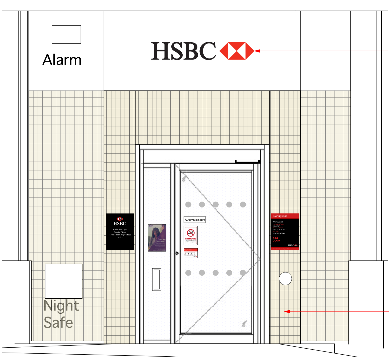
PROPOSED MAIN ENTRANCE ELEVATION

NON ILLUMINATED LETTERS AND LOGO ABOVE ENTRANCE DOOR.