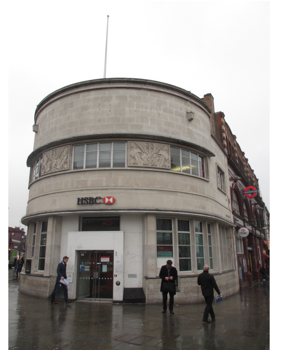
EXISTING MAIN ENTRANCE PHOTO