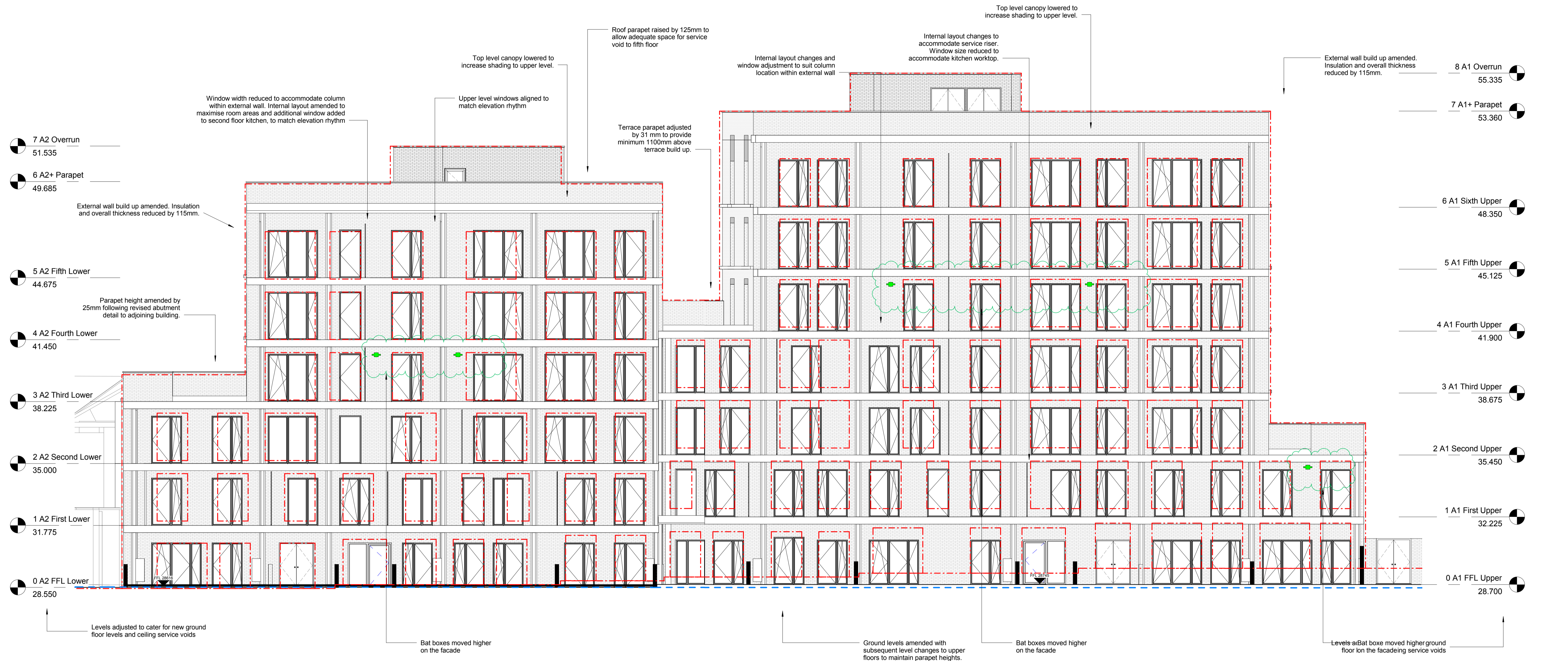
Plot A - South Elevation with screens removed for clarity