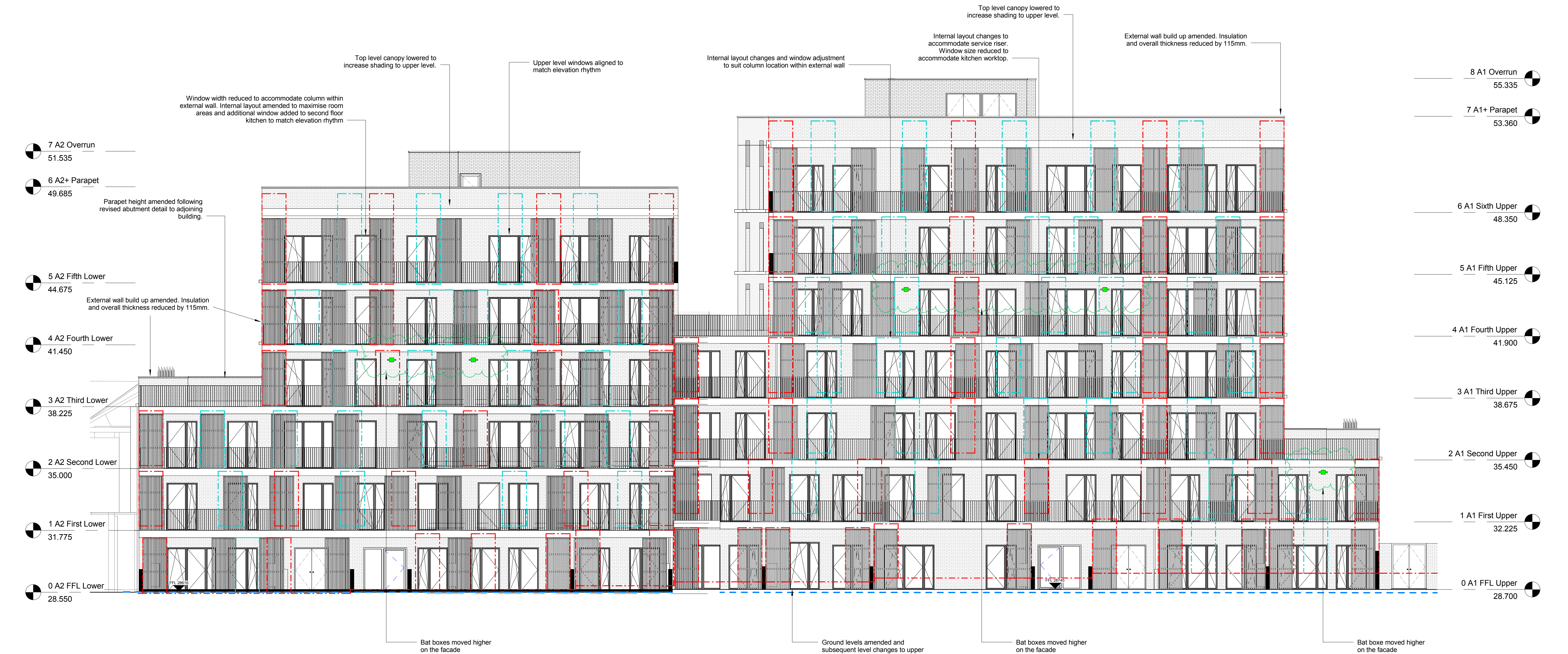
Plot A - South Elevation