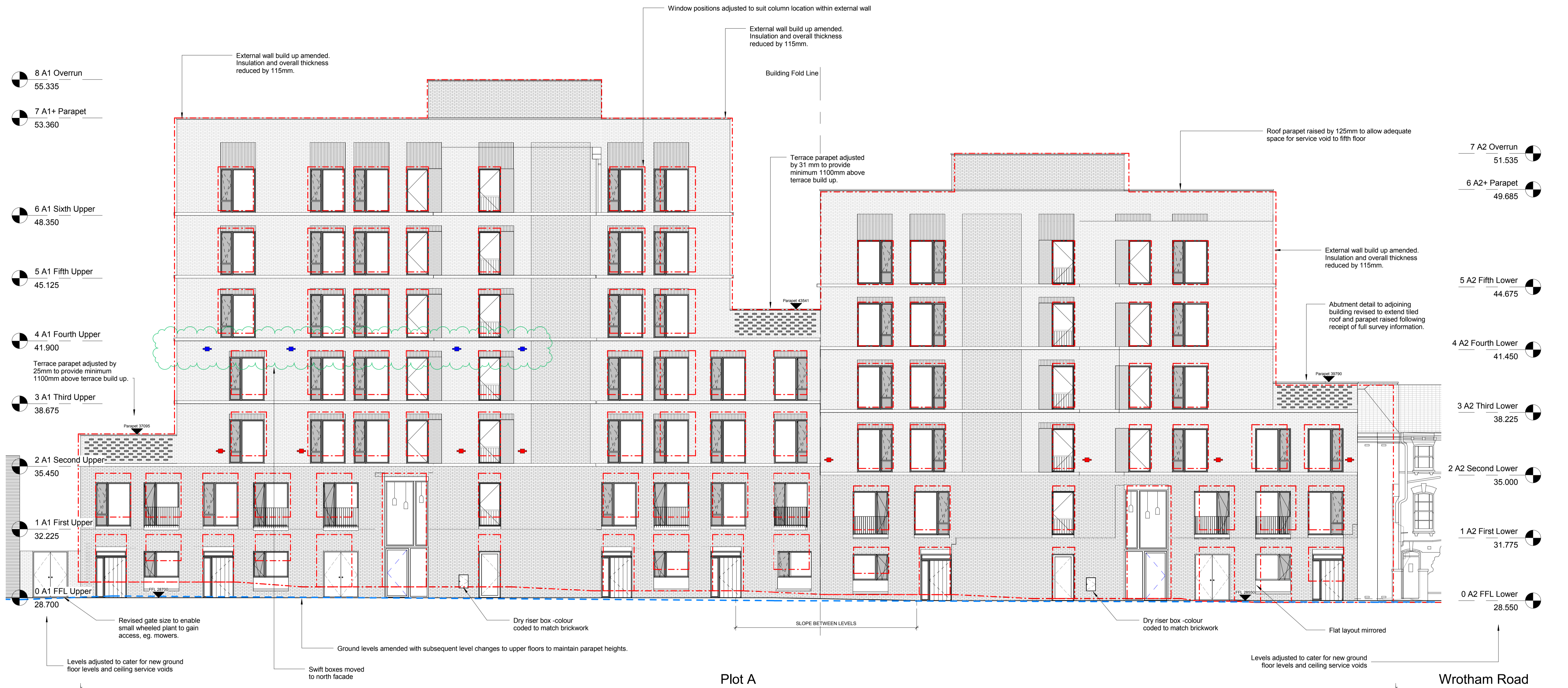
Plot A - North Elevation