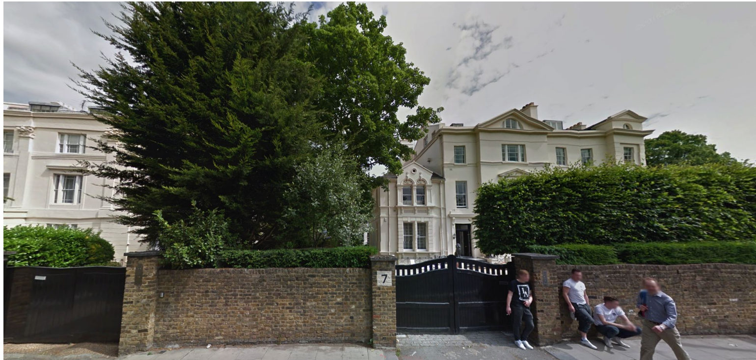
Site photo 1 - view from road