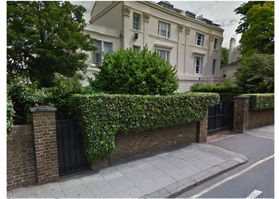
Site photo 2 - Example of side gate at 9 Prince Albert Road