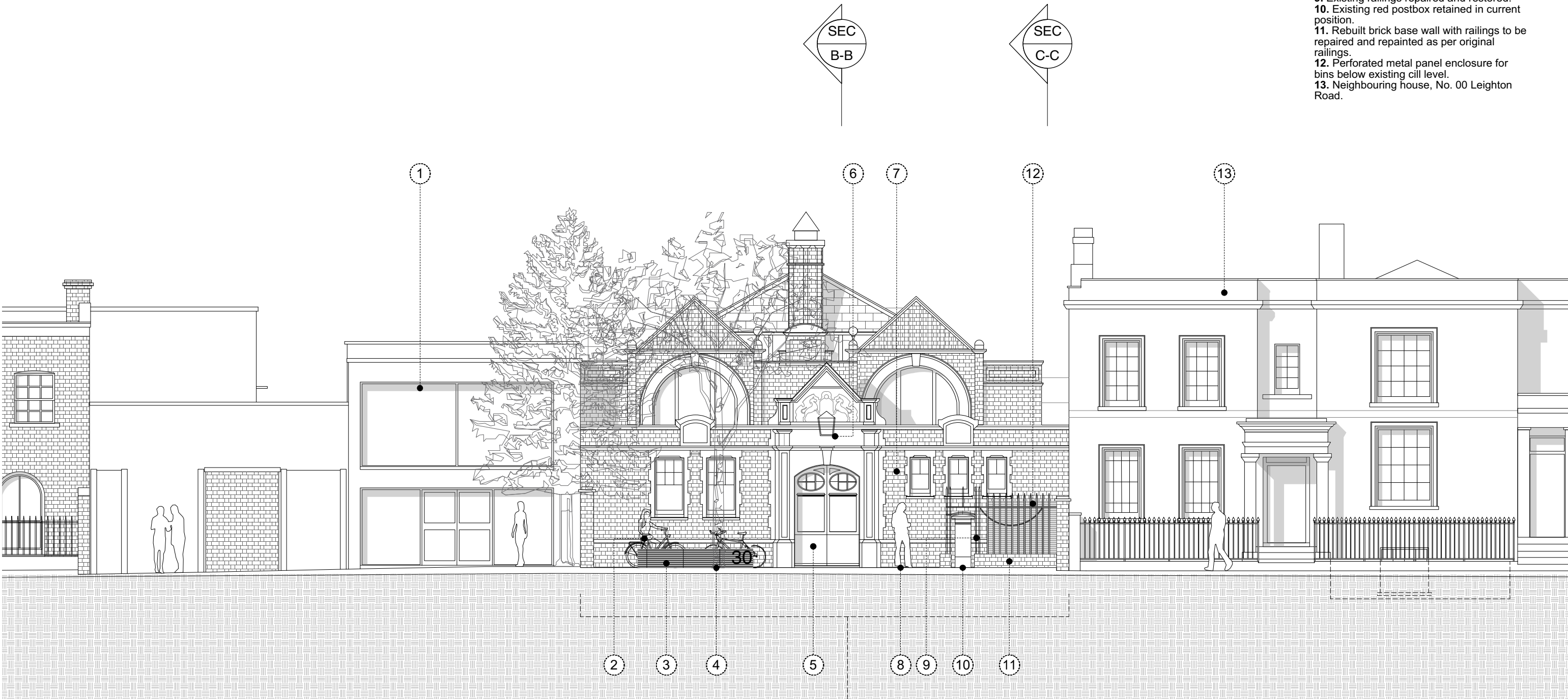
POSTMEN'S SORTING OFFICE 30 Leighton Road