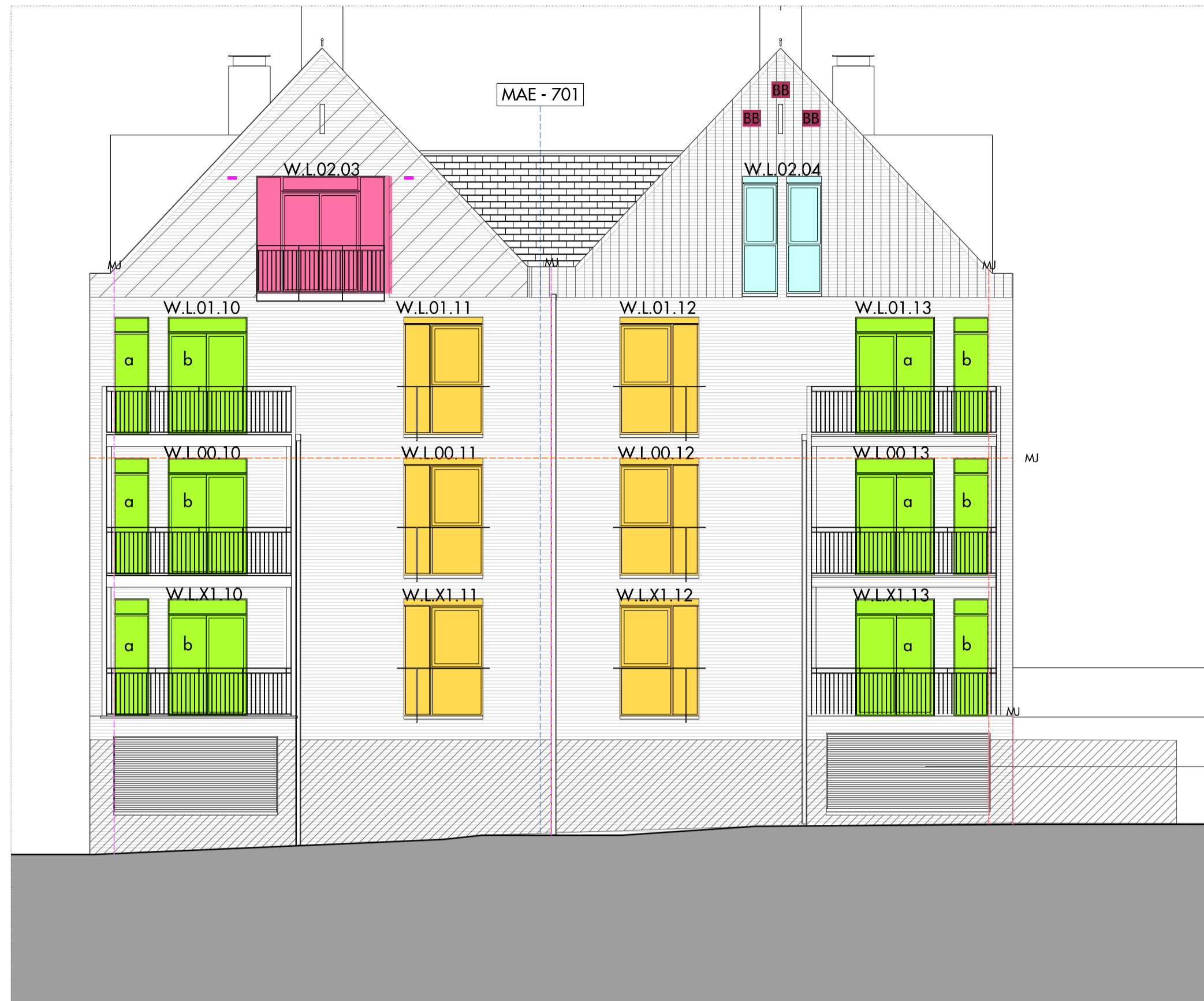
01 BLOCK L / ELEVATION- SOUTH WEST COMMUNAL GARDEN