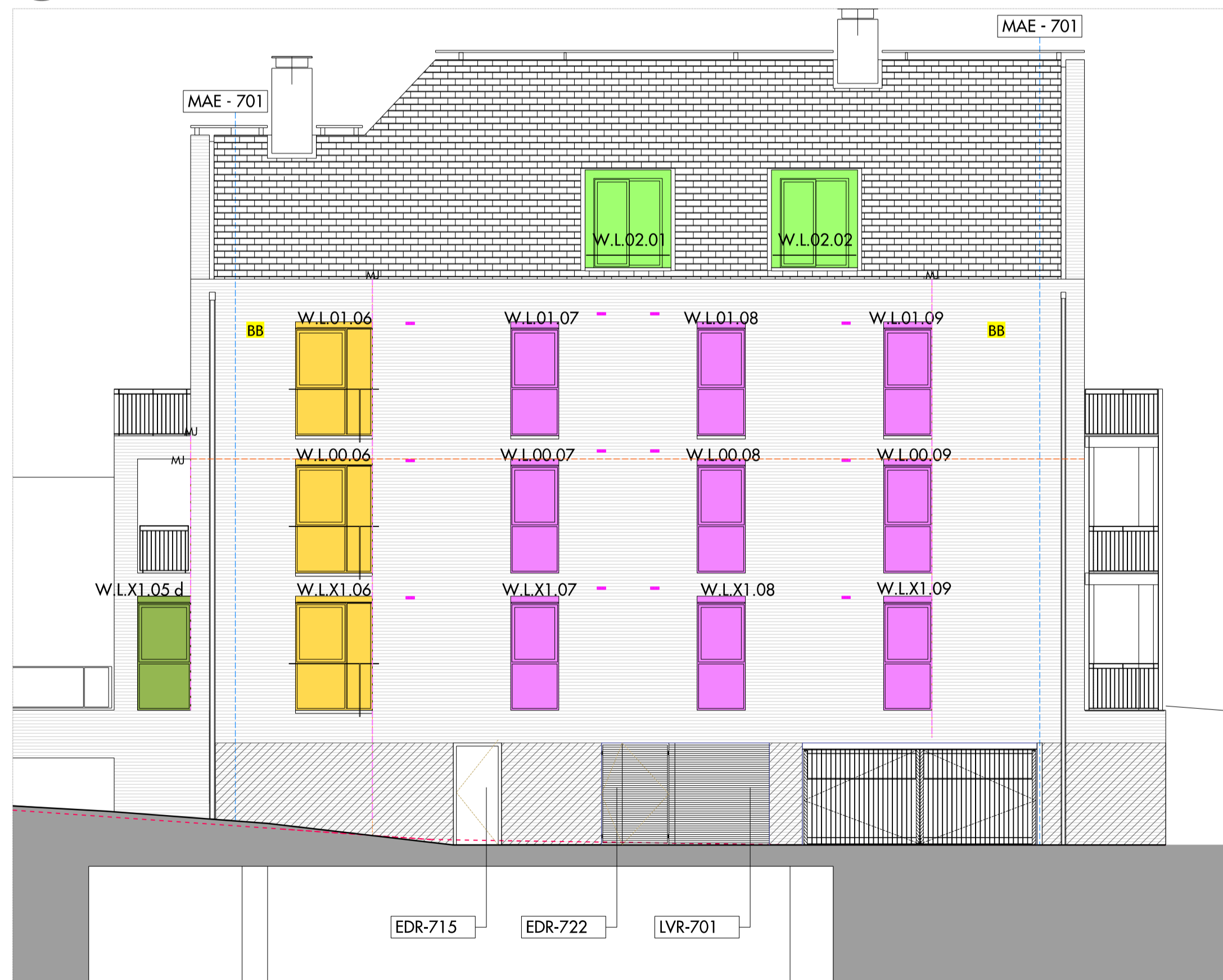
04 BLOCK L / ELEVATION- NORTH WEST

NOTES: Drawings to be read in conjunction with: - 809_07_06_170 series setting out drawings - 809_07_21 series drawings - 809_07 Window schedule - 809_20_WIN_EDR_Window systems Specification MVRH unit requires two air bricks per flat. For location refer to GA's and details Masonry restraint support angles to return in recessed balcony. Refer to Structural Engineer drawings and specification for all masonry restraint items such as masonry angles, brick ties, wall starters, reinforcement and lintels.