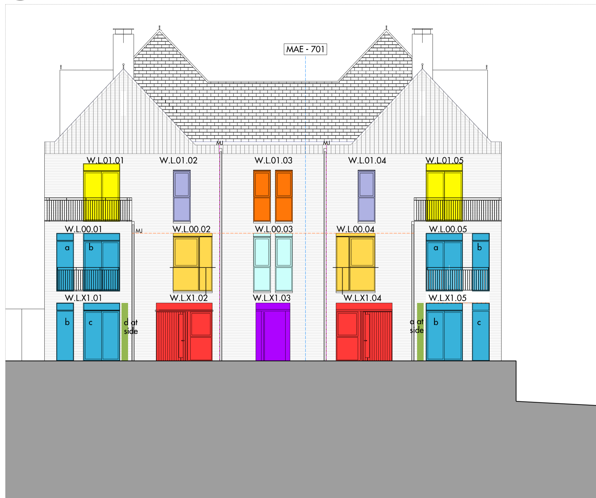
03 BLOCK L / ELEVATION- NORTH EAST KIDDERPORE AVENUE