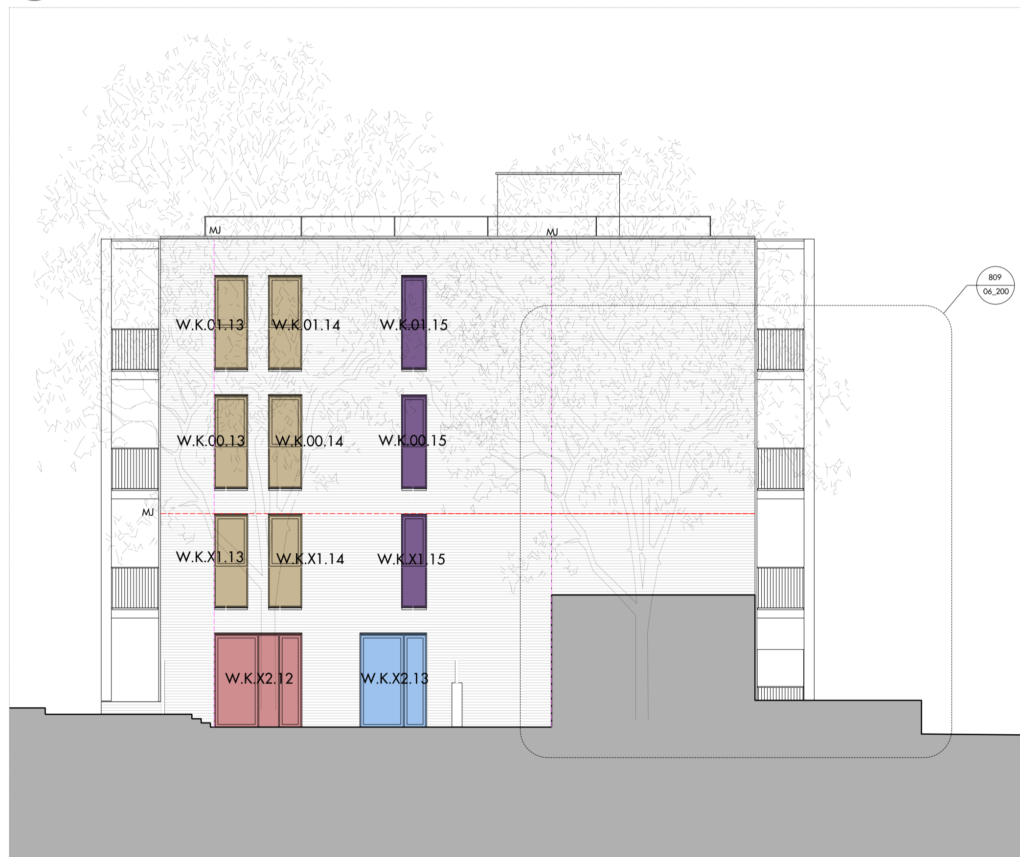
03 BLOCK K1 / ELEVATION- NORTH EAST KIDDERPORE AVENUE