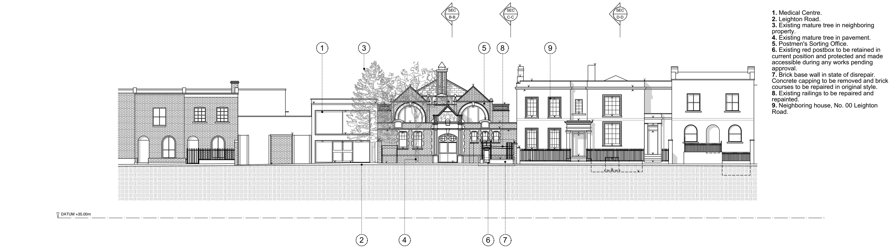
SECTION A-A: THROUGH LEIGHTON ROAD (POSTMEN'S SORTING OFFICE FRONT ELEVATION)