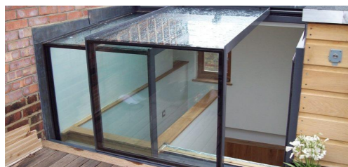
Glazing Vision Bespoke Sliding Rooflight