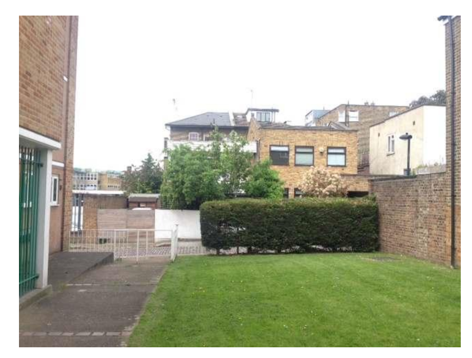
View from Abingdon Close

All dimensions are to be checked on site prior to construction. Any discrepancies are to be reported to the architect before works commence. All dimensions are in millimeters. Do not scale dimension. This drawing is to be read in conjuction with the specification and with all relevant consultants'/specialists' drawings and/or documents.