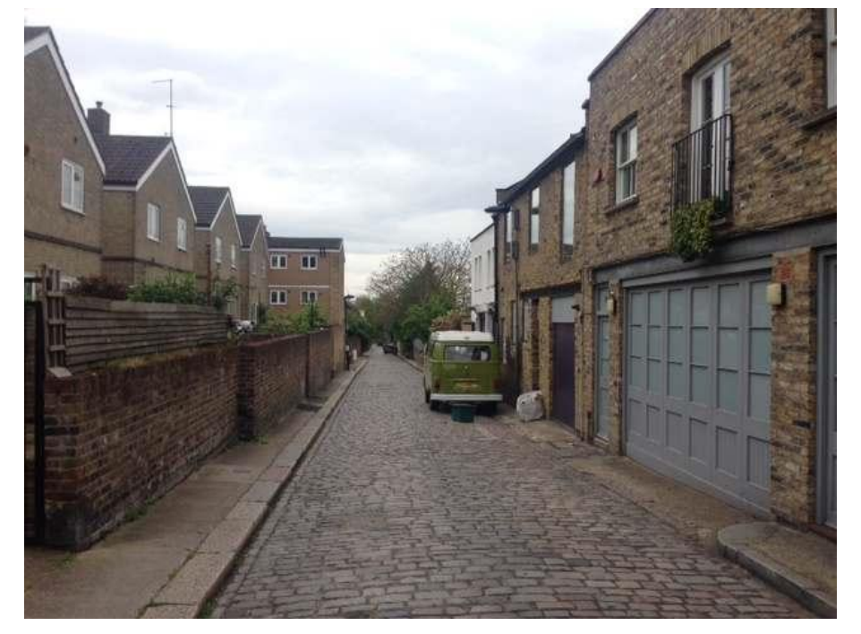
View from Camden Mews