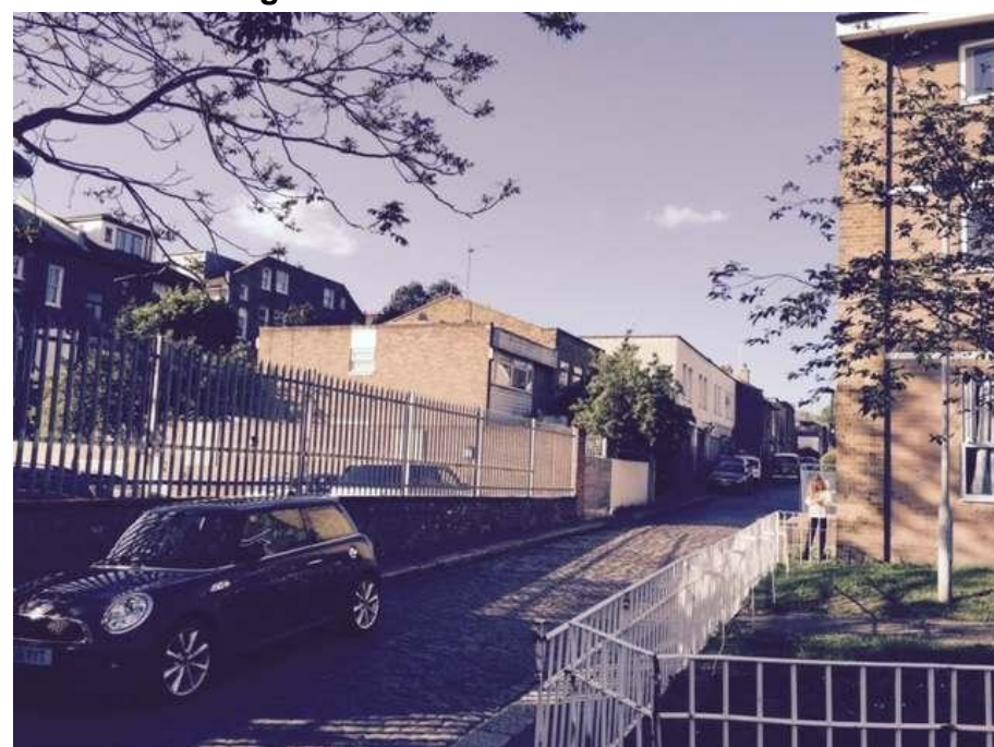
View up camden mews with Tesco car park on left and Abingdon Close flats on right