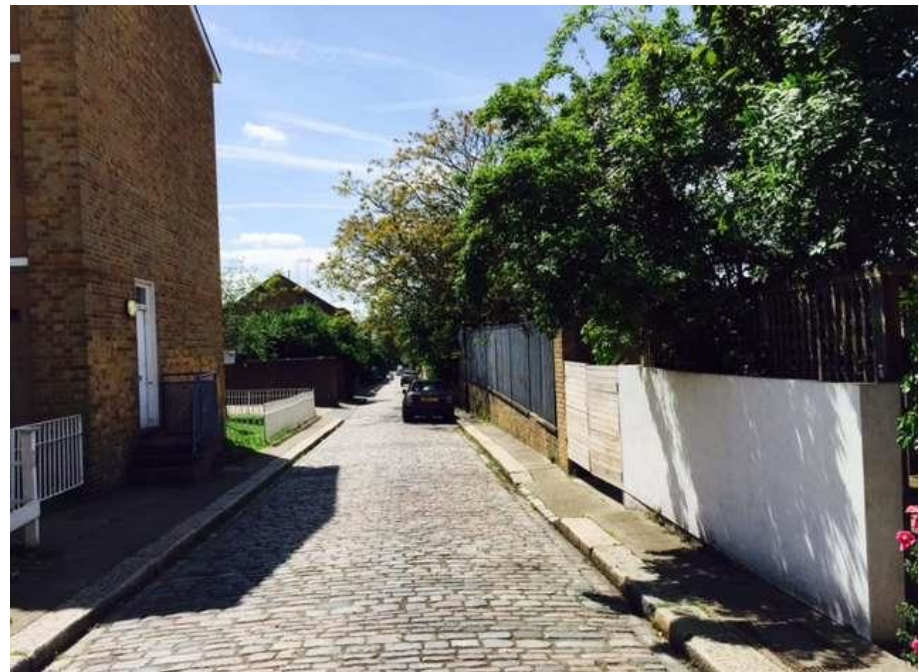
View down Camden Mews showing Abingdon Close flats opposite no 57 Camden Mews