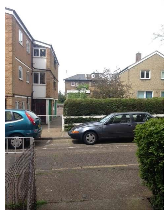
View from Camden Square