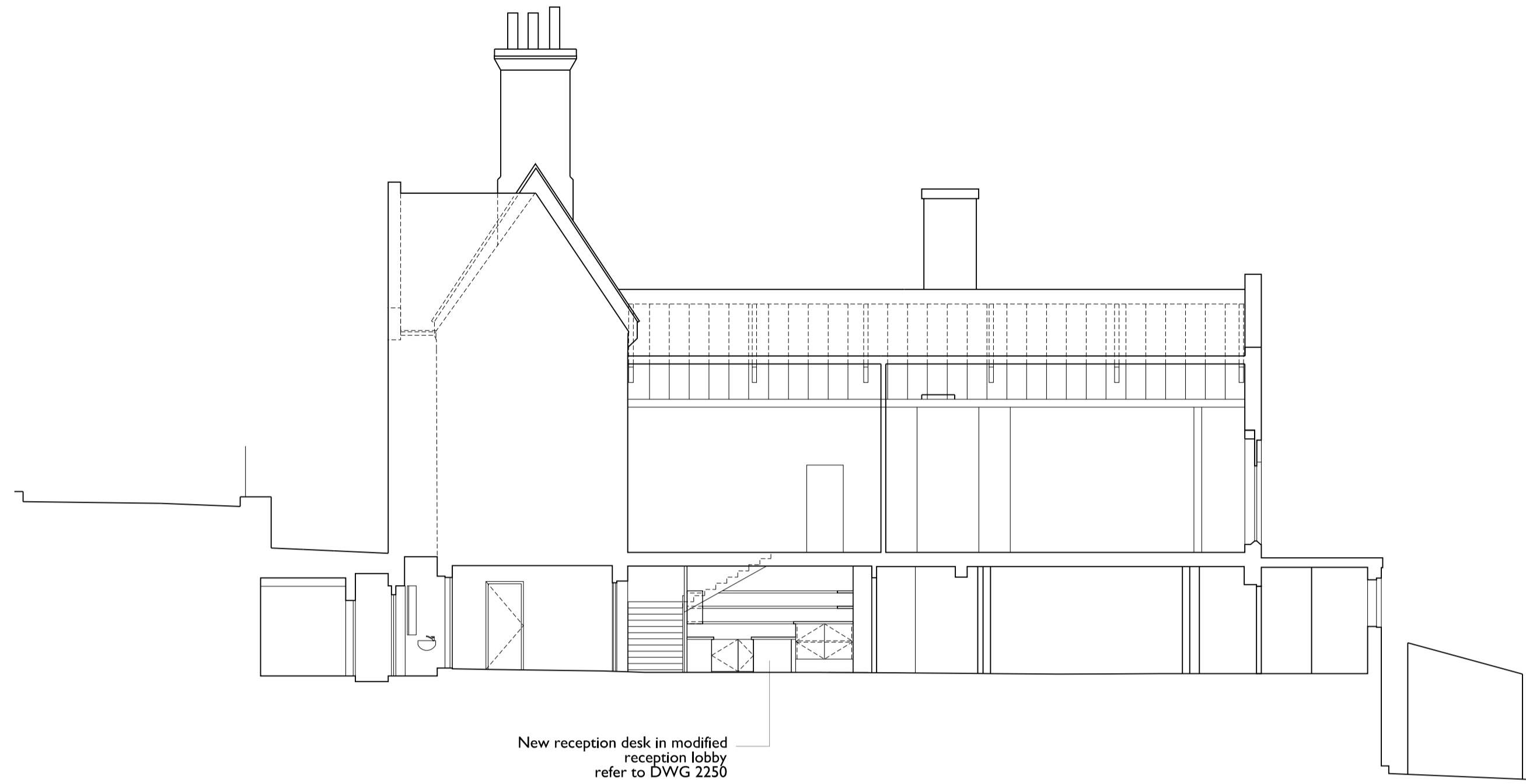
2 Section B-B 1220 Scale 1:100