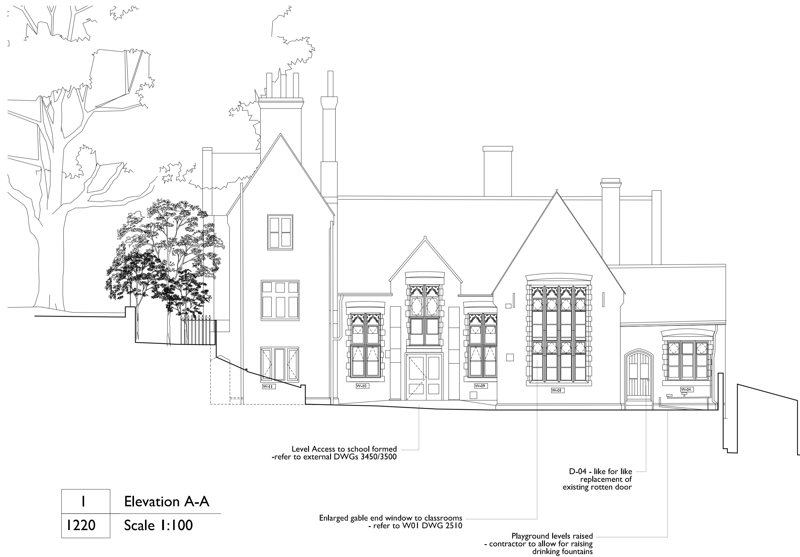
1 Elevation A-A 1220 Scale 1:100