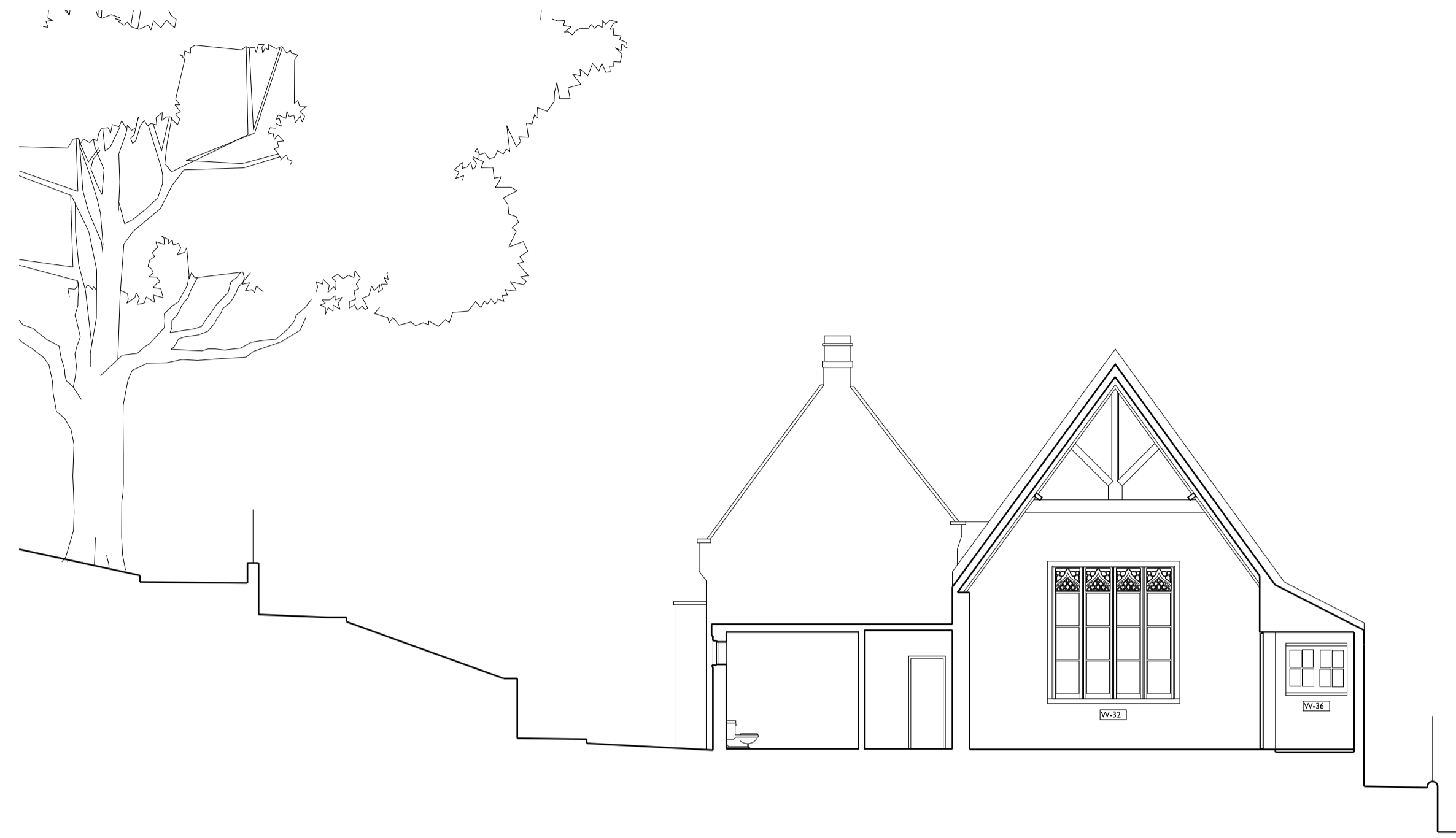
4 Section D-D 1220 Scale 1:100