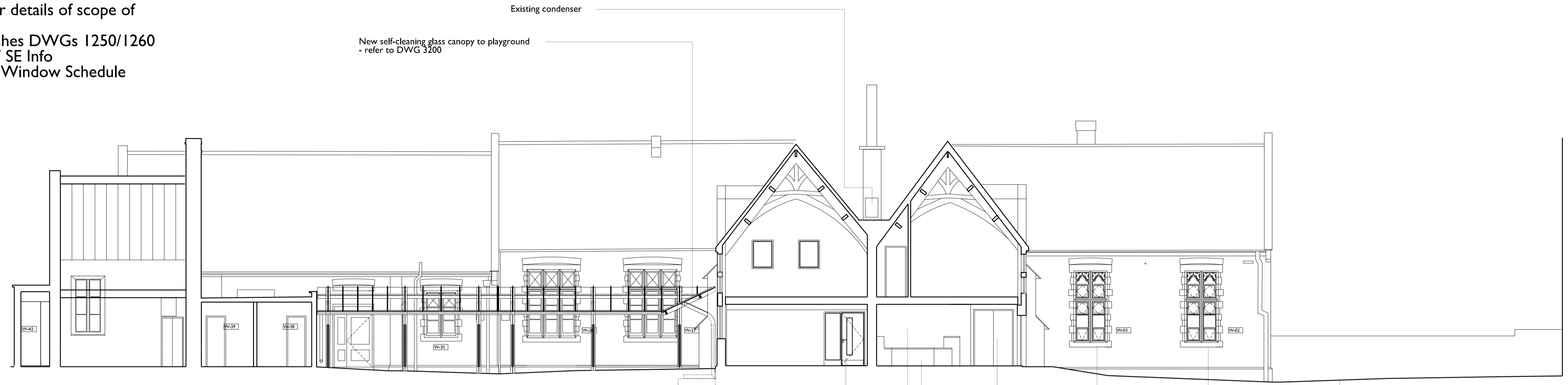
3 Section 6-6 1210 Scale 1:100

Note: - for details of Demolition works refer to DWG 0500/0510 - refer to Refurbishment Schedule for details of scope of individual room refurb - read in conjunction with Floor Finishes DWGs 1250/1260 - read in conjunction with M+E Info / SE Info - read in conjunction with Door and Window Schedule