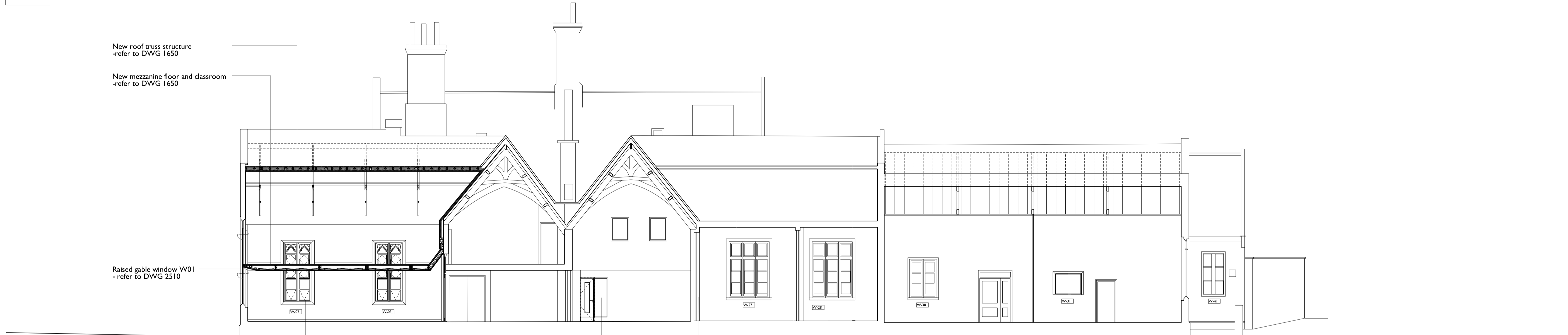
2 Section 2-2 1200 Scale 1:100