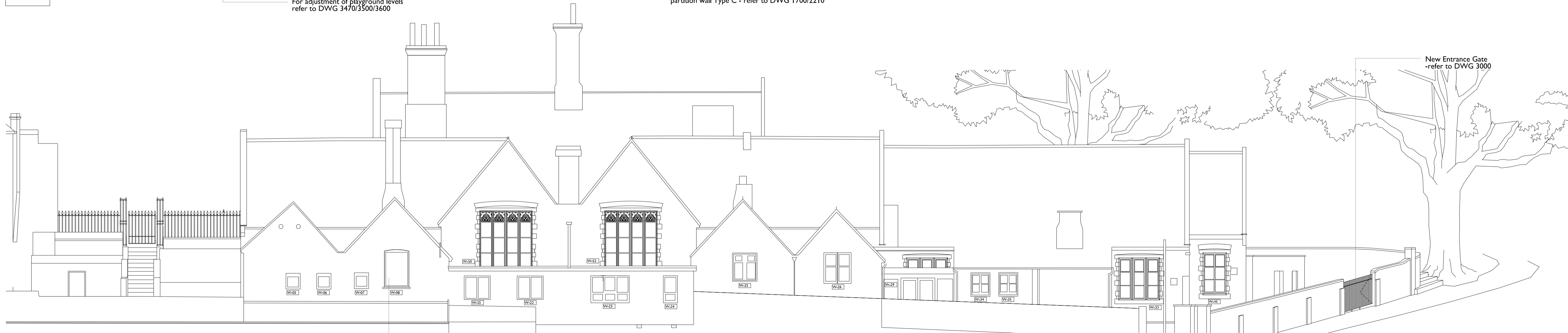
1 Elevation 1-1 1200 Scale 1:100

SCABAL ARCHITECTS LTD. 25 Hatton Garden London EC1N 8BQ UK t: +44 (0) 20 7033 8788 e: team@scabal.net