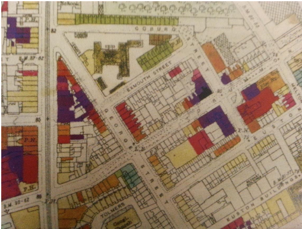
200 North Gower Street (and surrounding buildings within in terrace) shown on map as Light Red, "Seriously damaged but repairable at cost".