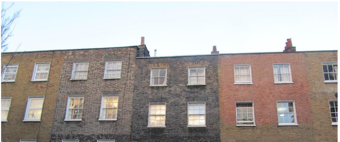
Existing top floor windows within terrace – showing different window pane configuration to rest of terrace