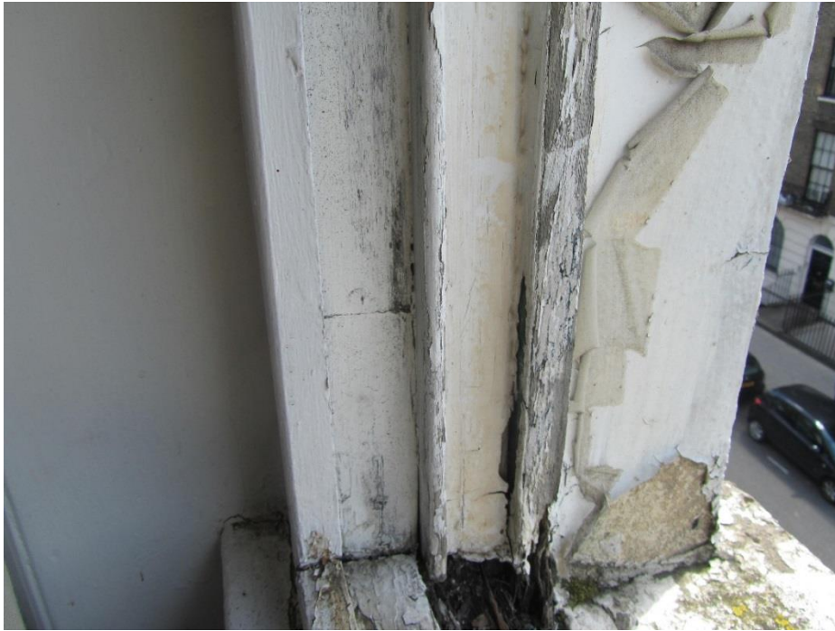
Existing condition of windows – window open