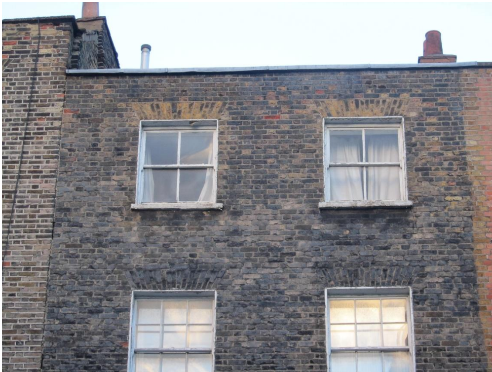
Existing top floor windows – four panes