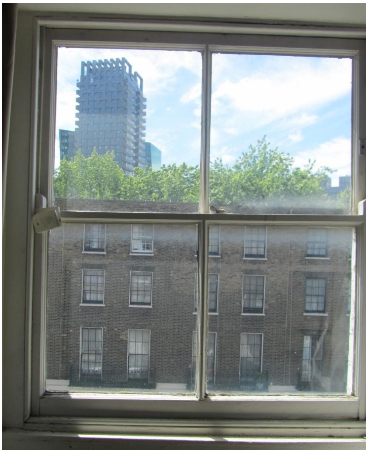
View of left hand window from interior