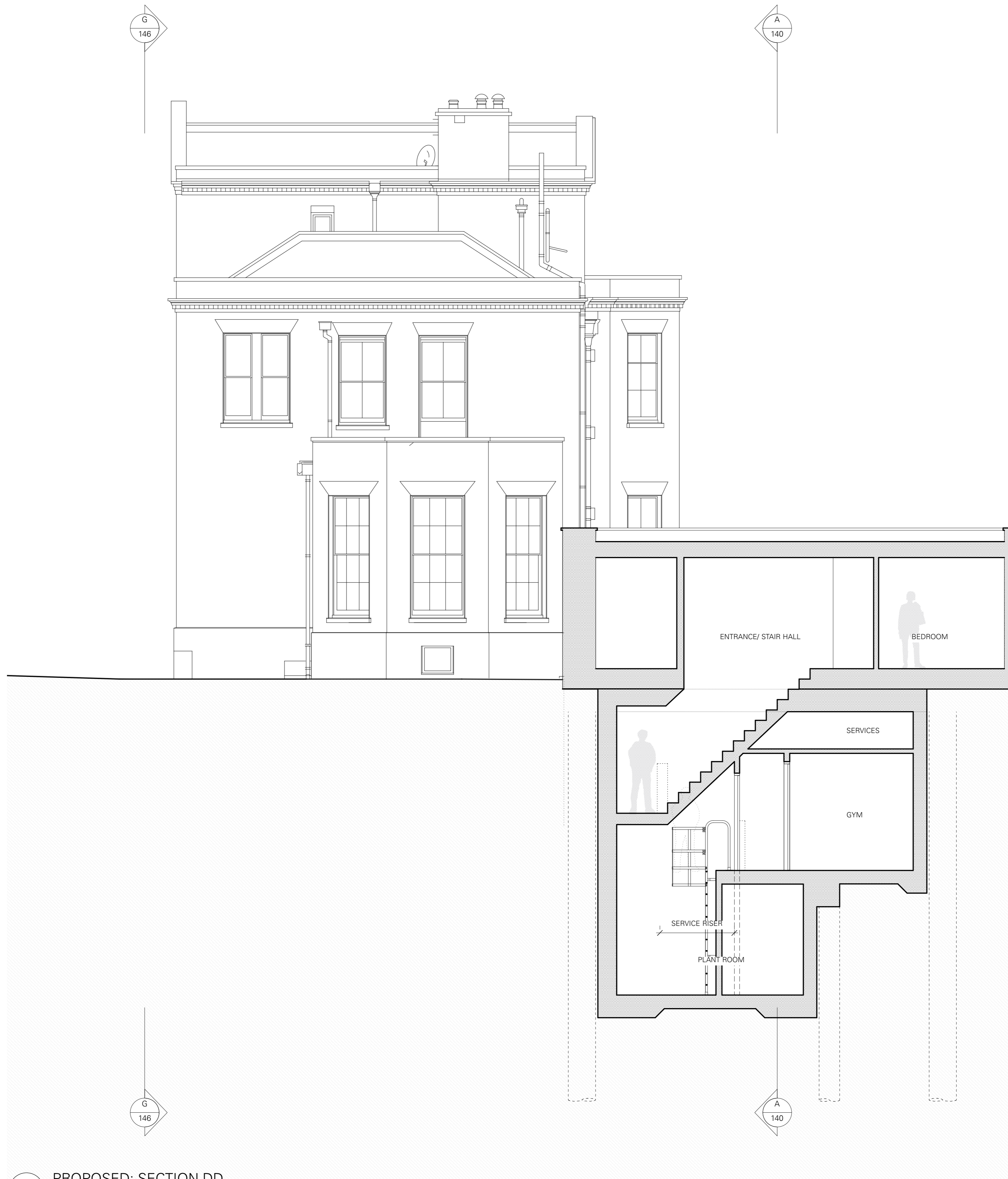
A PROPOSED: SECTION DD 1.50 @ A1, 1.100 @ A3