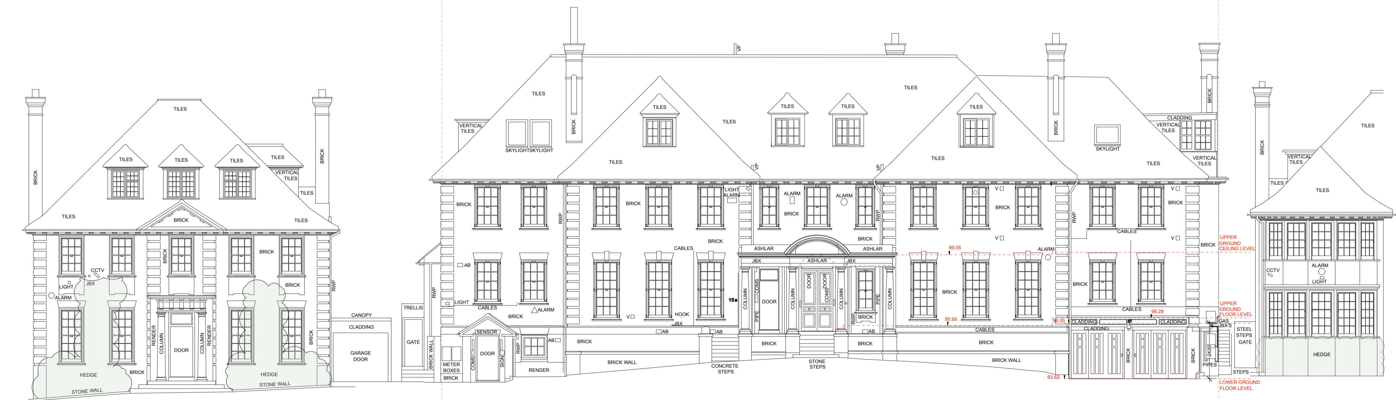
ELEVATION A- FRONT (SOUTH WEST) ELEVATION IN CONTEXT FACING GREENAWAY GARDENS