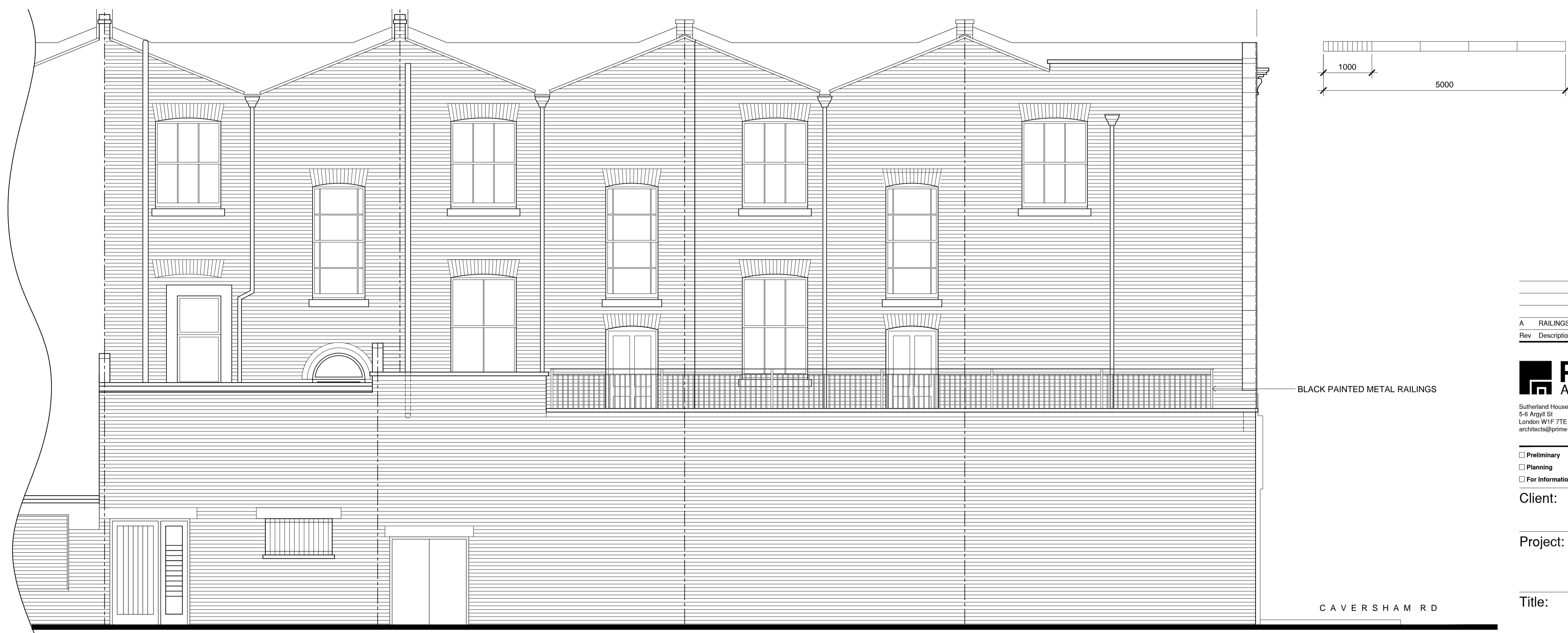
PROPOSED SIDE ELEVATION - CAVERSHAM ROAD