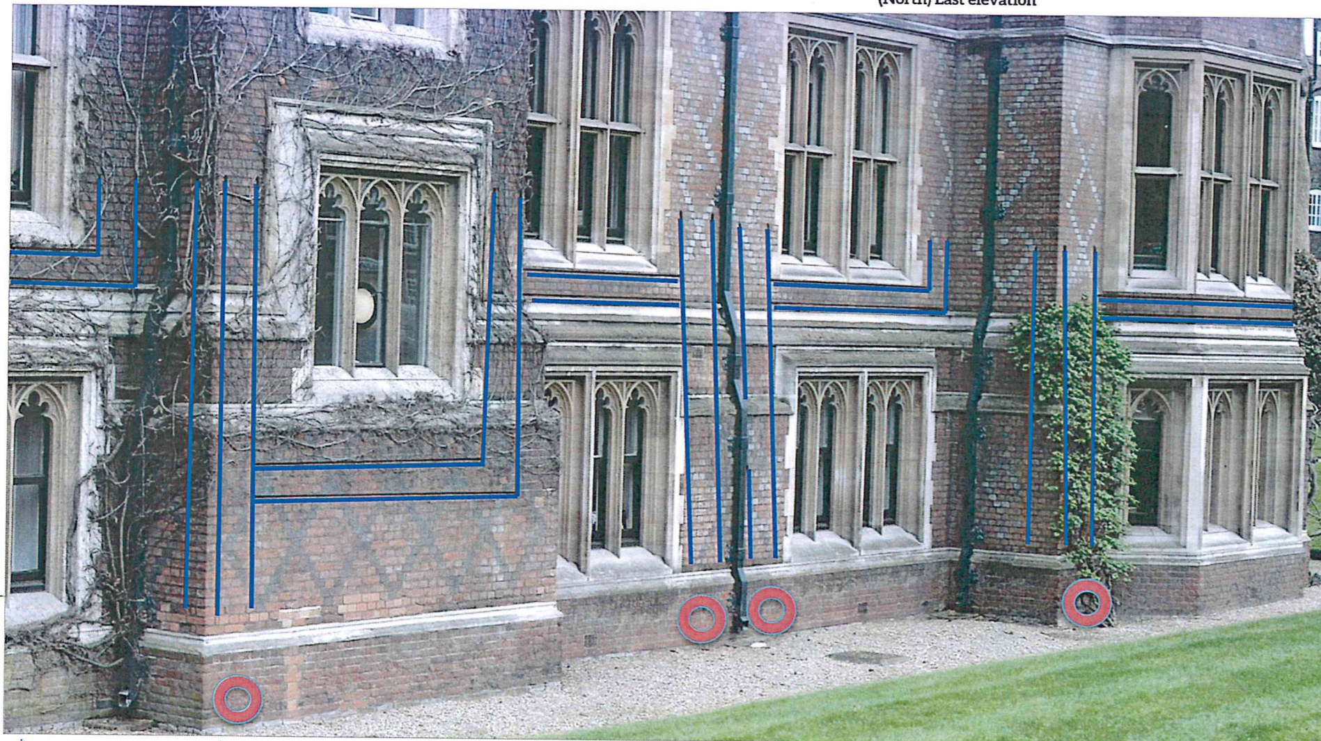
(South) East elevation