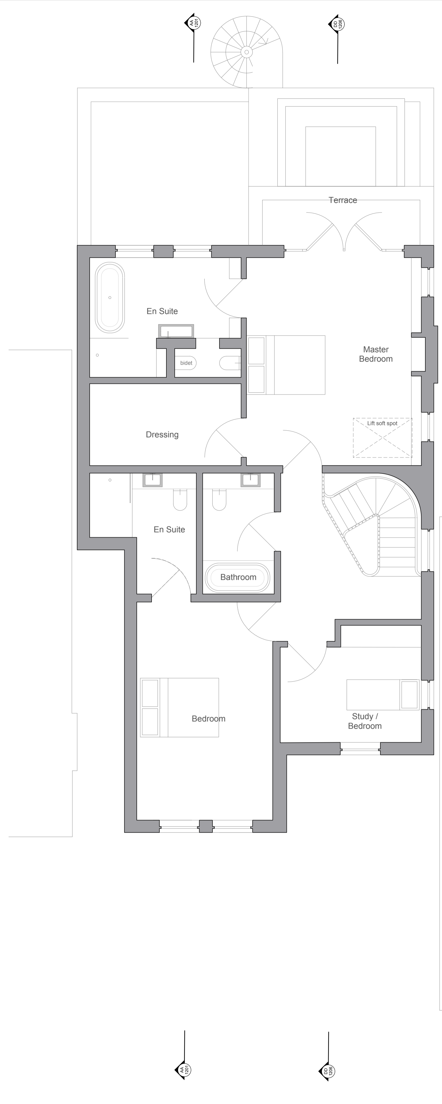
2 Proposed First Floor Plan