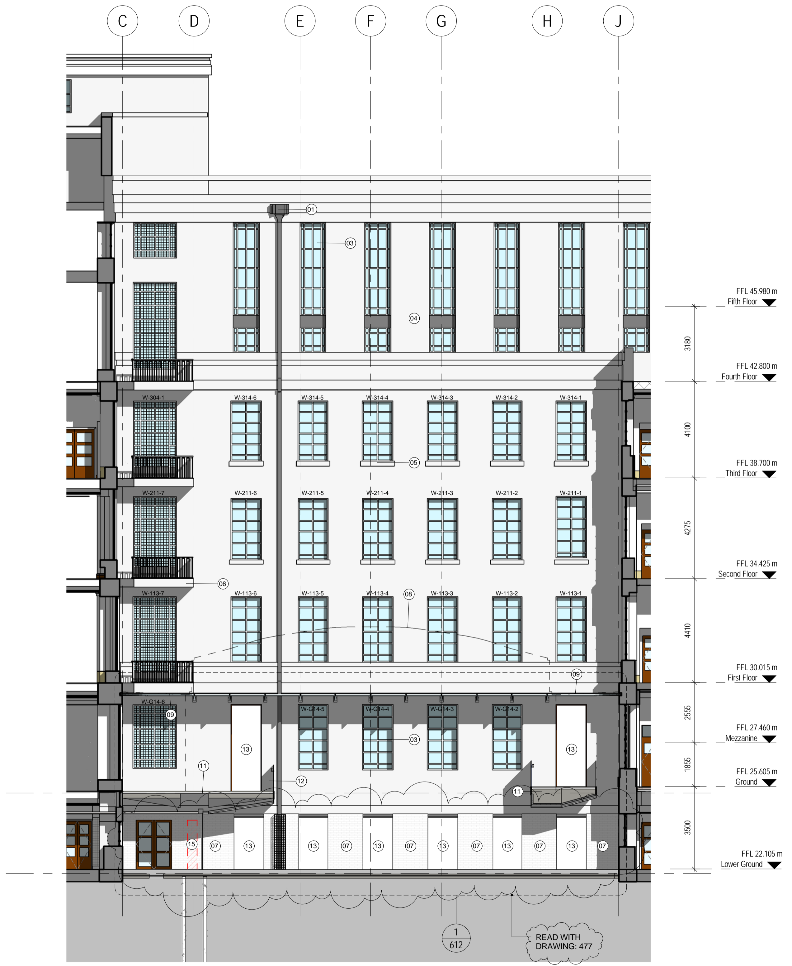
2 PROPOSED ELEVATION INTERNAL SOUTH 1:100