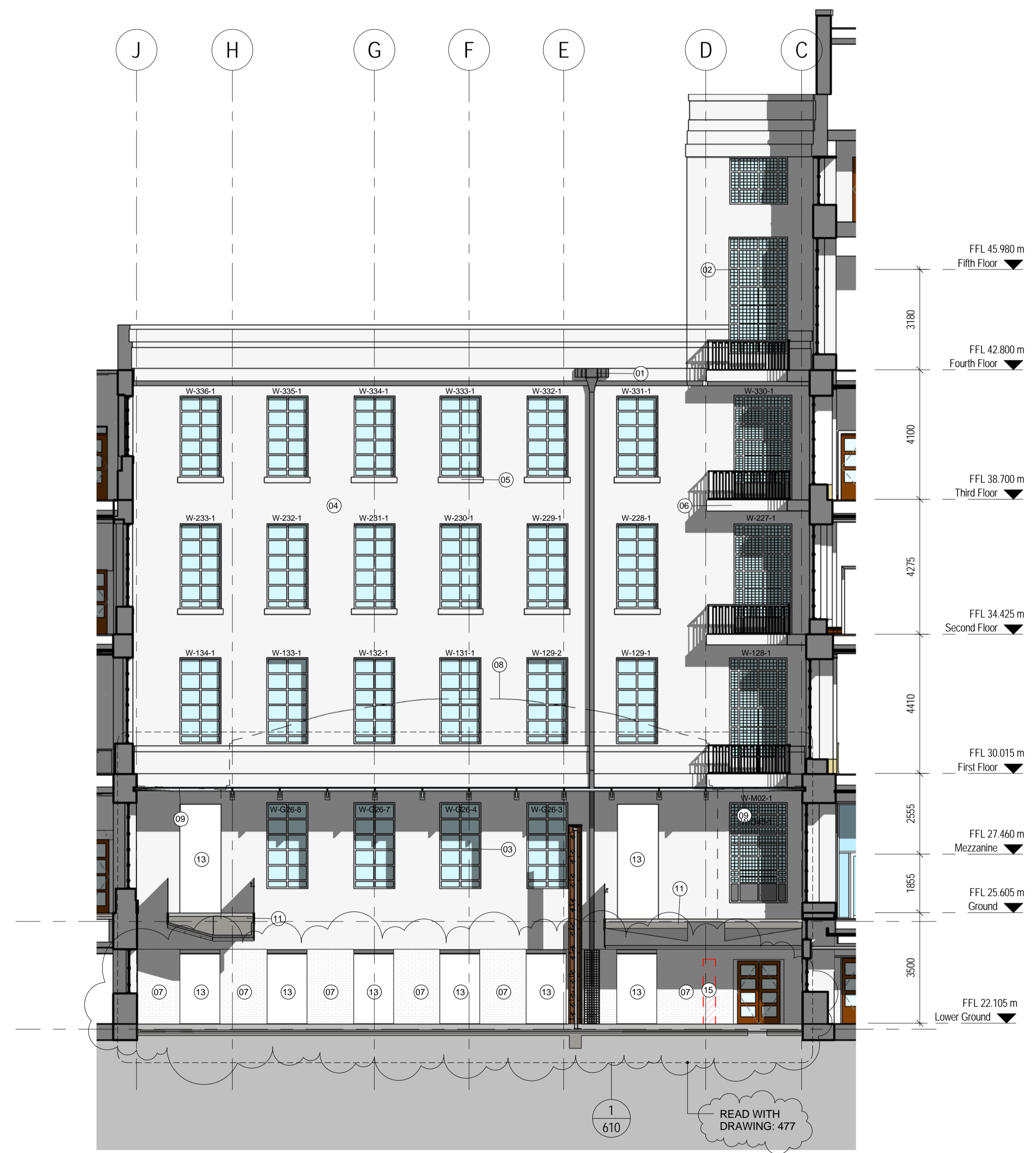
1 PROPOSED ELEVATION INTERNAL NORTH 1:100

INFORMATION HANDLING CLASSIFICATION UNRESTRICTED