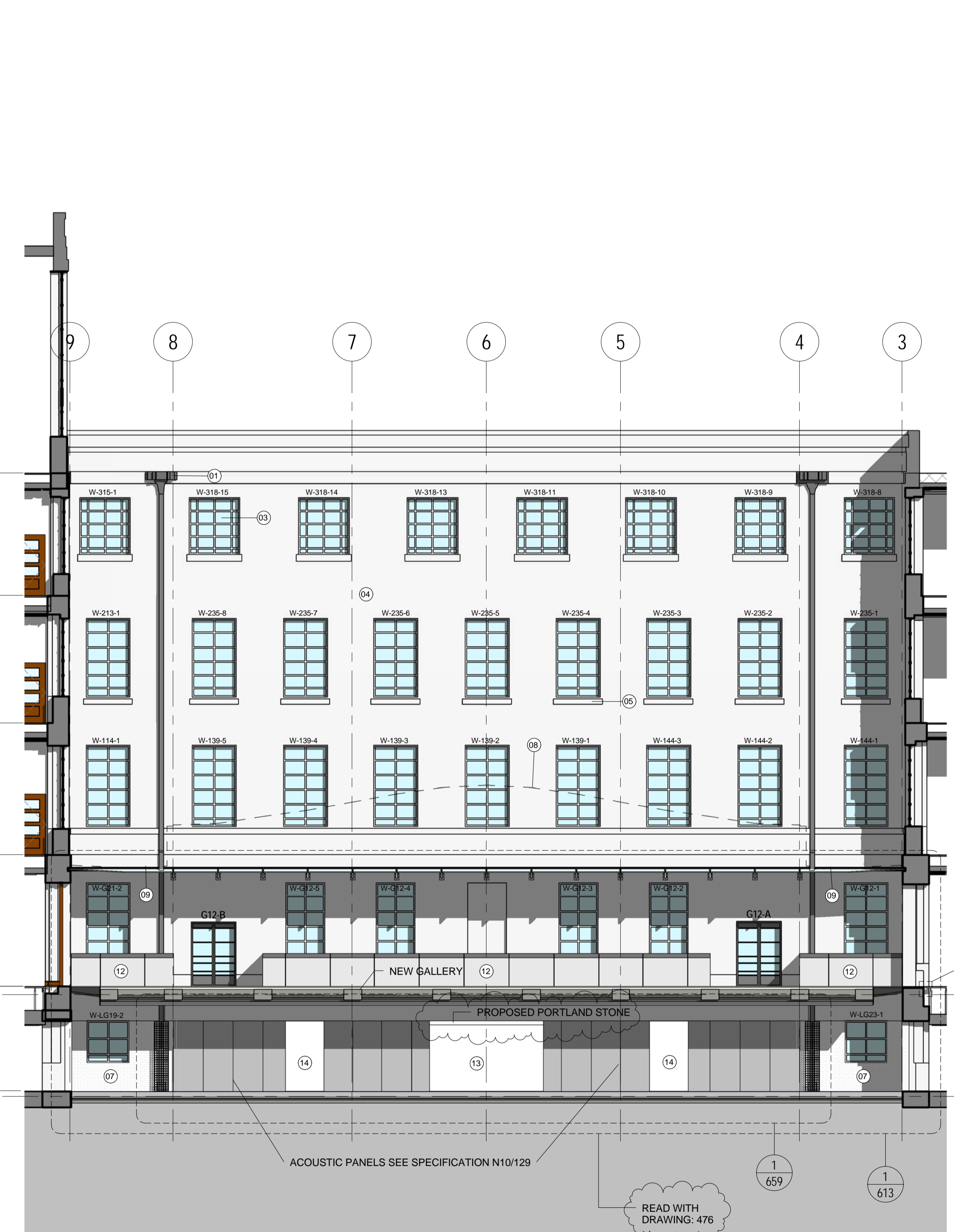
2 PROPOSED WEST COURTYARD ELEVATION 1:100