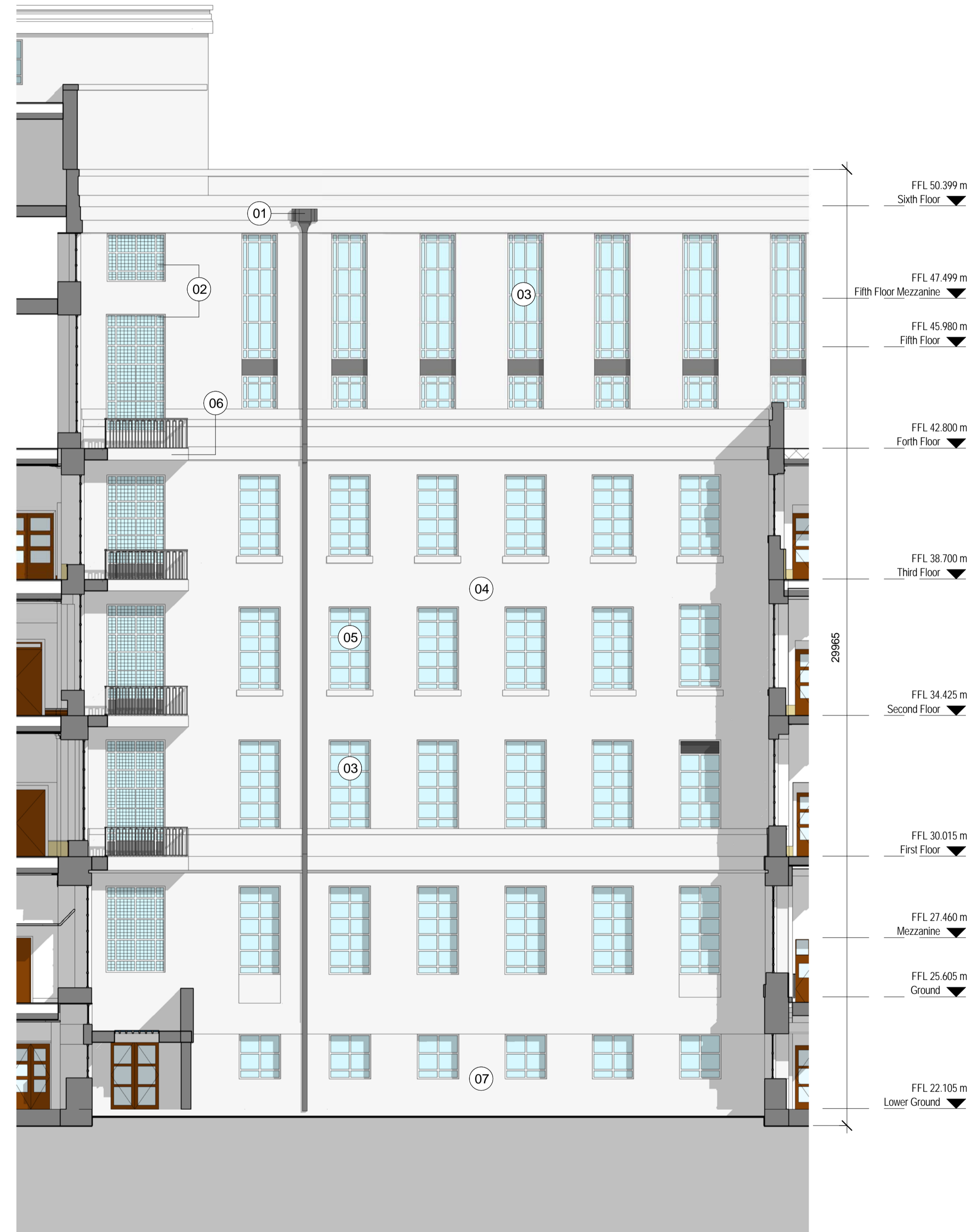
2 ELEVATION INTERNAL NORTH EXISTING 1:100