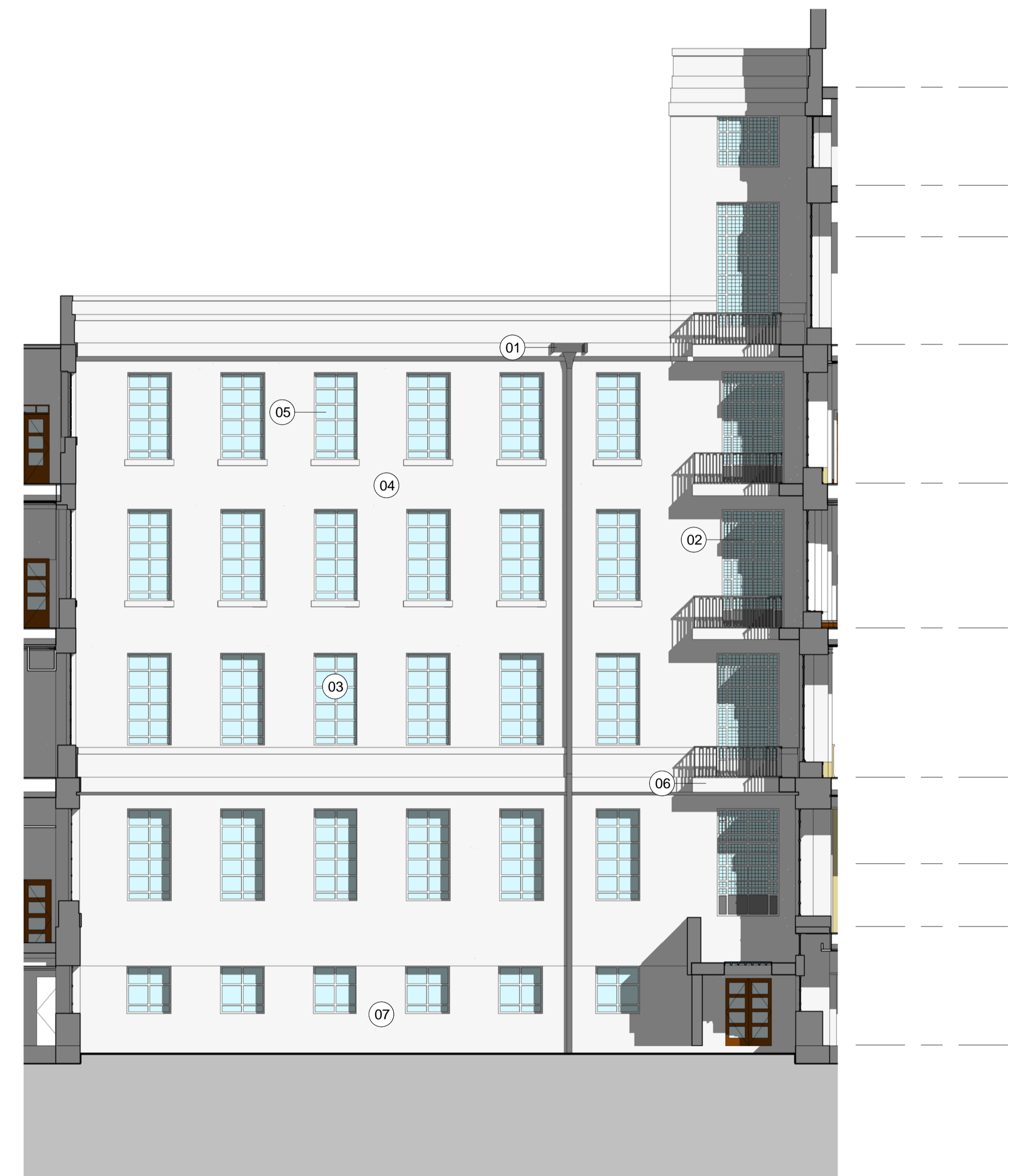
1 ELEVATION INTERNAL SOUTH EXISTING 1:100

INFORMATION HANDLING CLASSIFICATION UNRESTRICTED