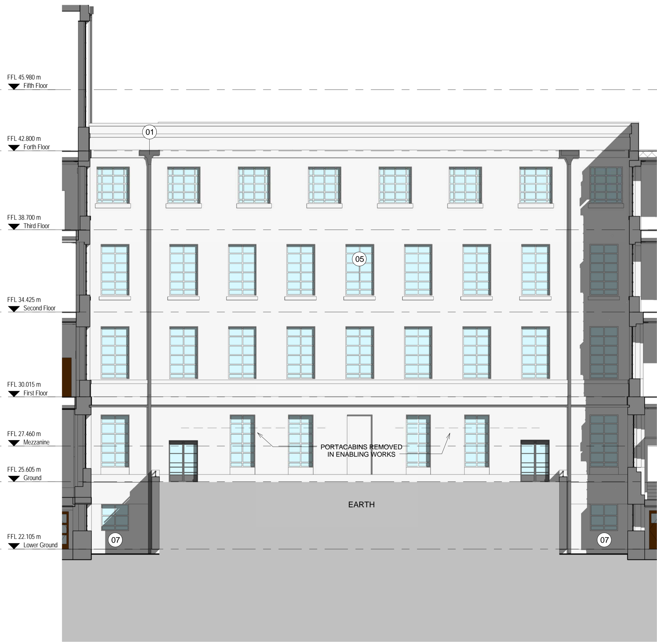
2 ELEVATION INTERNAL WEST EXISTING 1 : 100

© COPYRIGHT Mace Group NOT TO BE REPRODUCED WITHOUT WRITTEN PERMISSION. BECAUSE OF POSSIBLE SCALING ERRORS IN ELECTRONIC AND HARDCOPY REPRODUCTION DO NOT SCALE FOR CONSTRUCTION PURPOSES. ALL DIMENSIONS TO BE CHECKED & VERIFIED ON SITE PRIOR TO CONSTRUCTION.