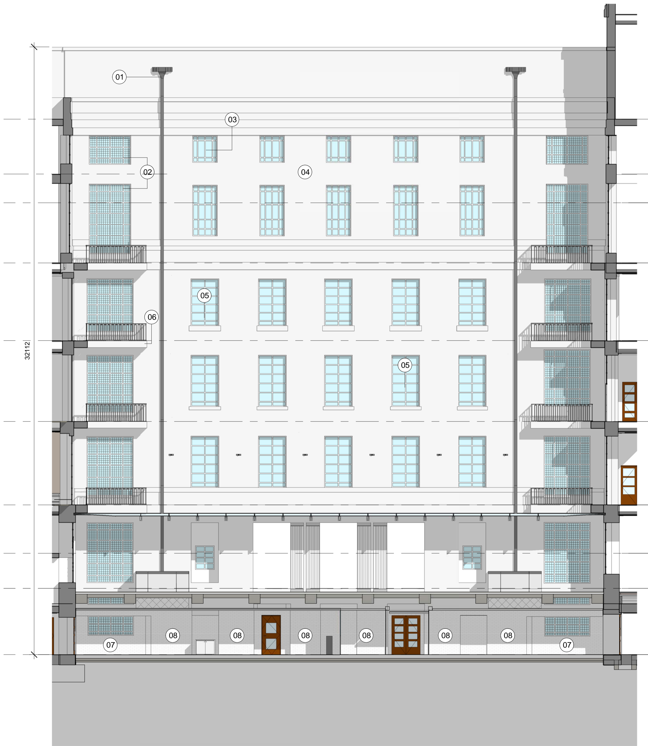
1 ELEVATION INTERNAL EAST EXISTING 1 : 100