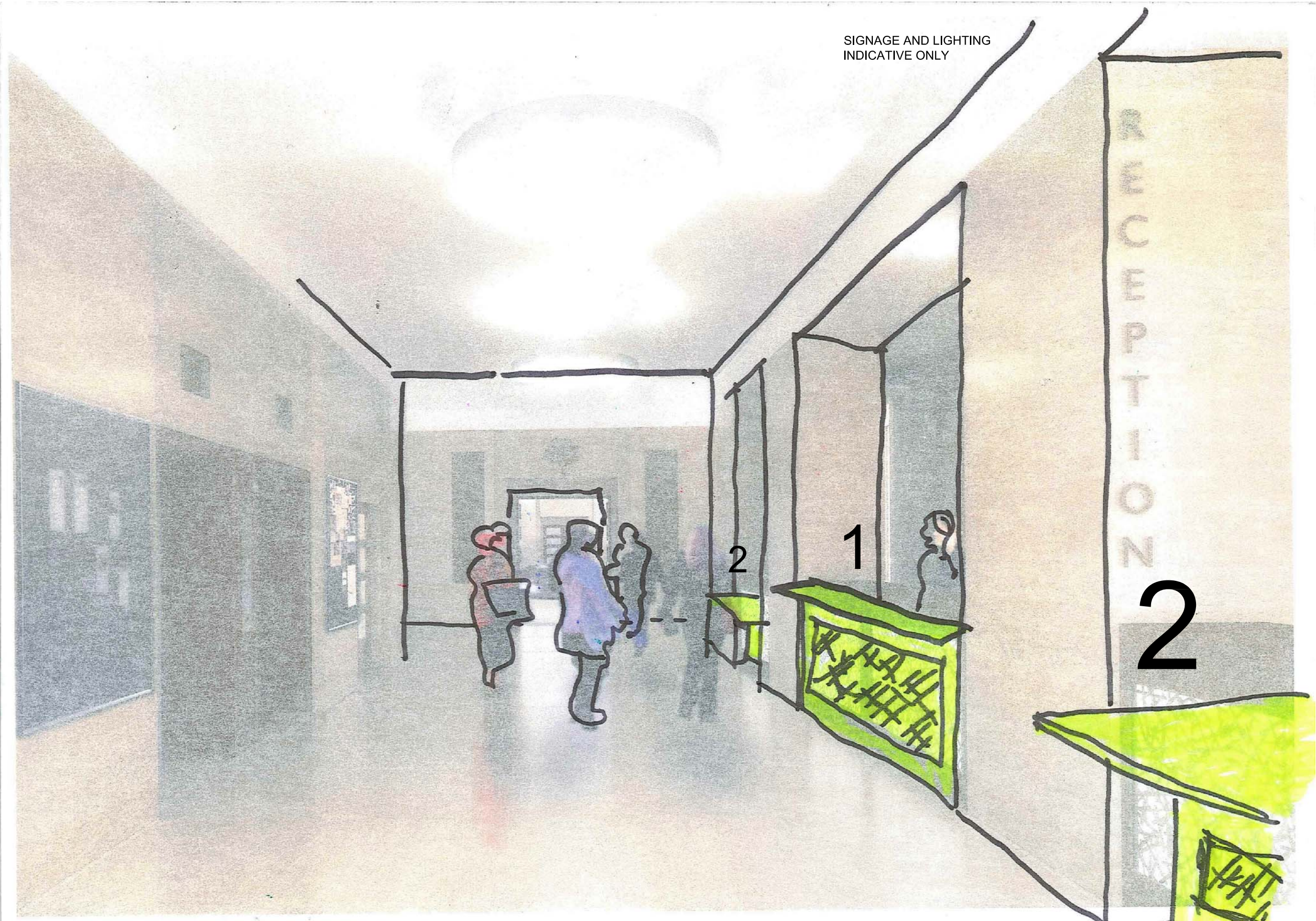
SKETCH SHOWING IMPACT OF RECEPTION DESKS REVISED FOR WHEELCHAIR ACCESS.