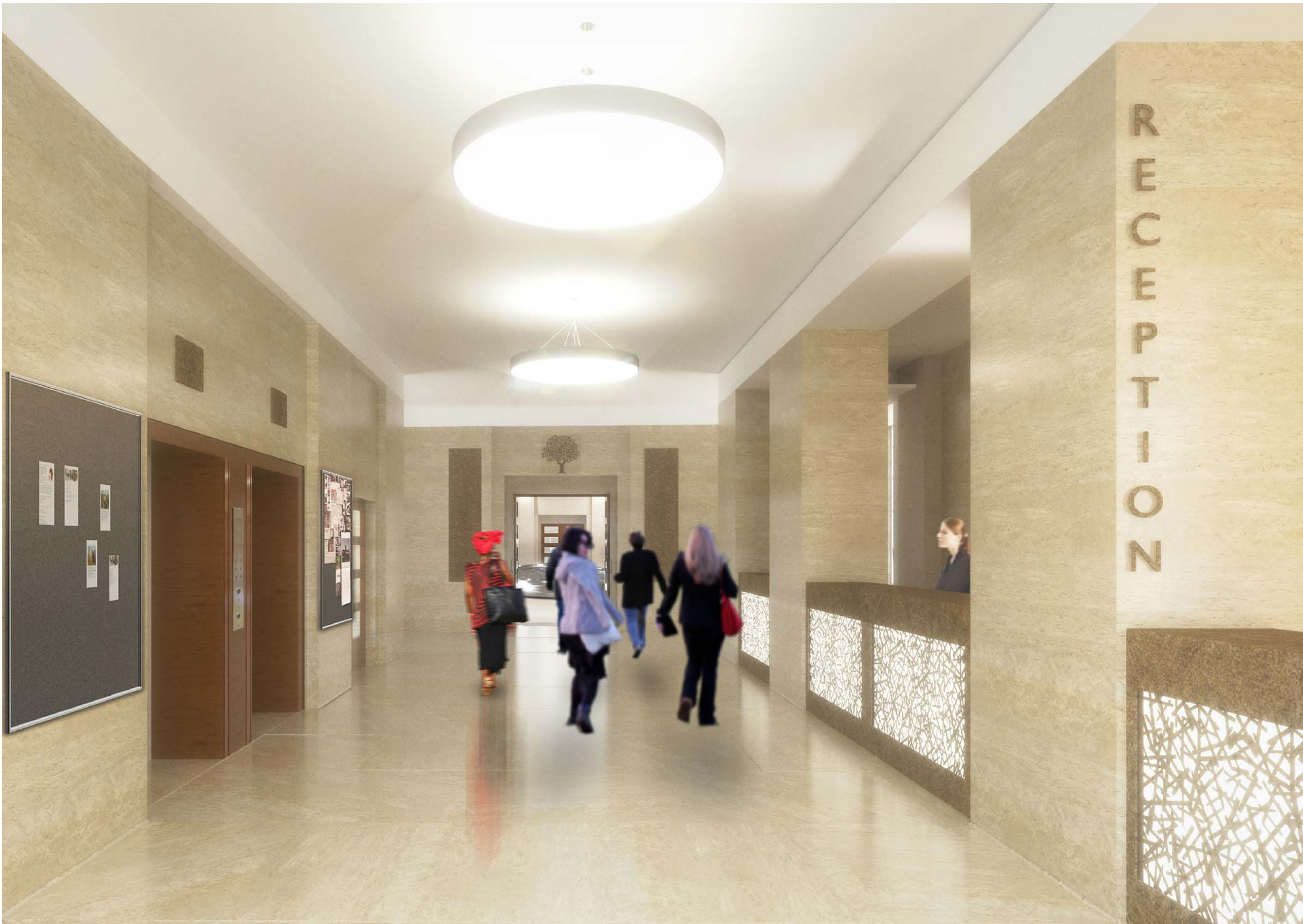
RENDER SHOWING RECEPTION DESK CONCEPT AT PLANNING STAGE