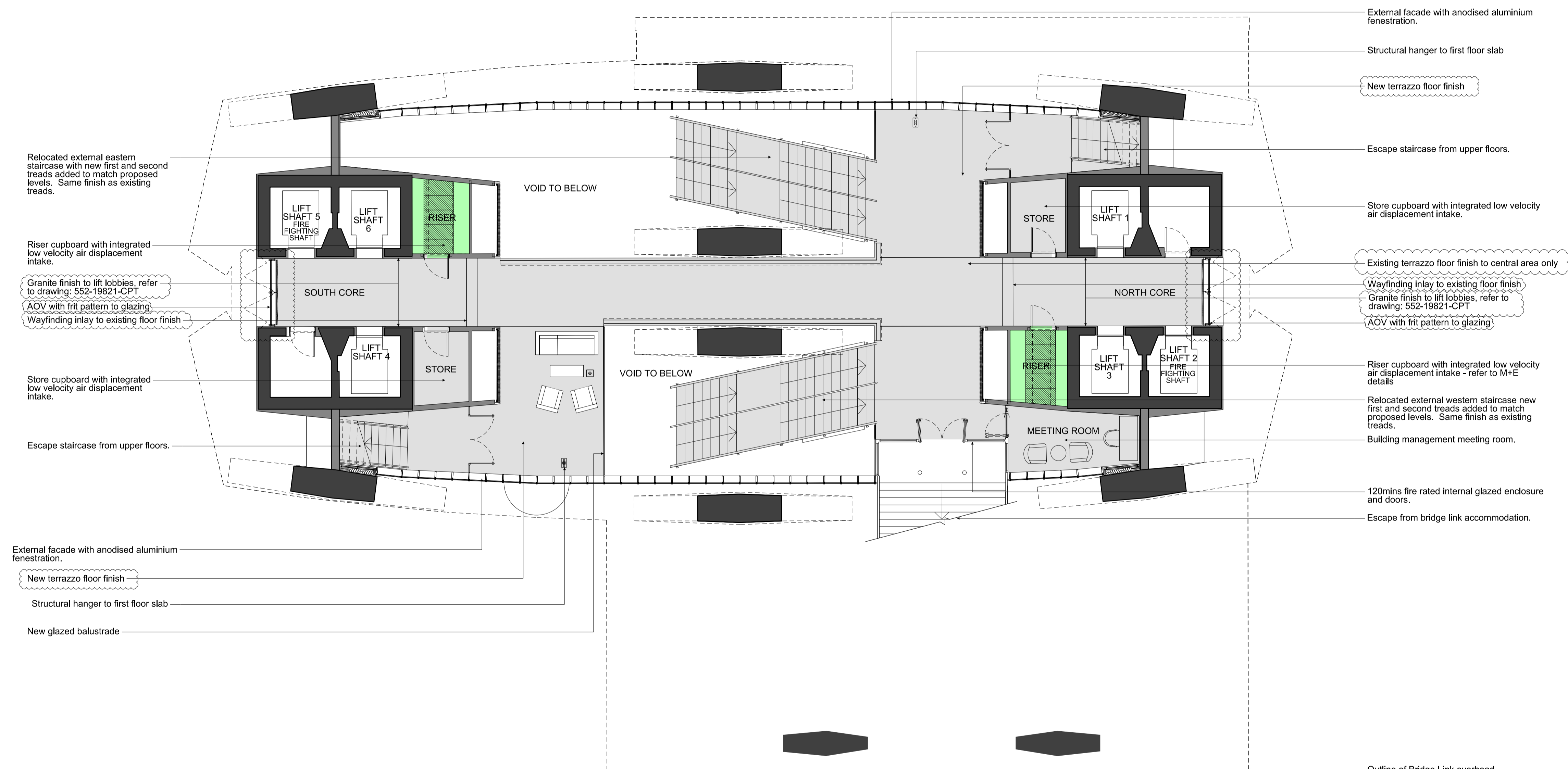
1 MEZZANINE PLAN 1:100 PROPOSED