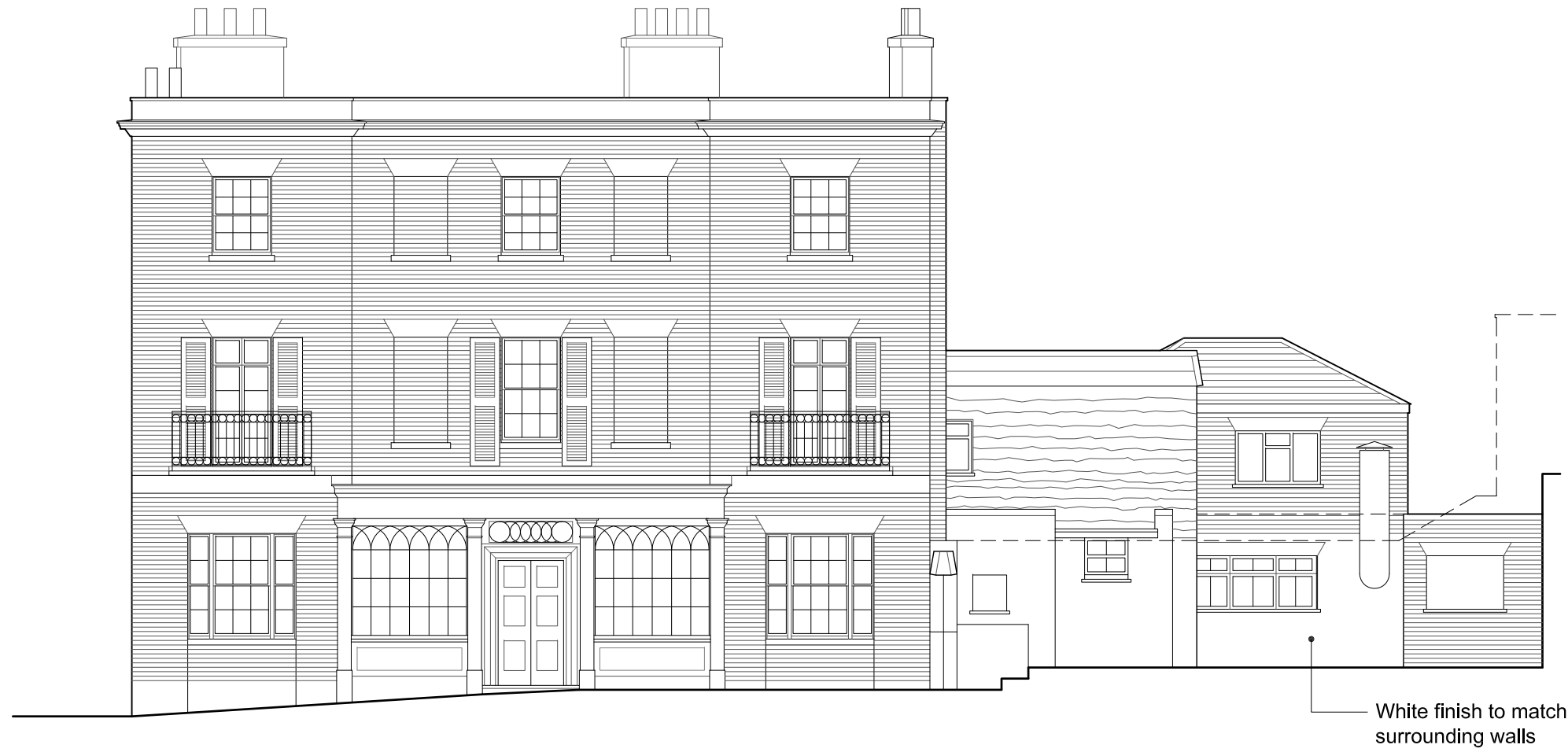
1 North Elevation - Proposed Scale 1:100 5m

Page size: A3 Page no: 7 of 7 Drawing no: A-202